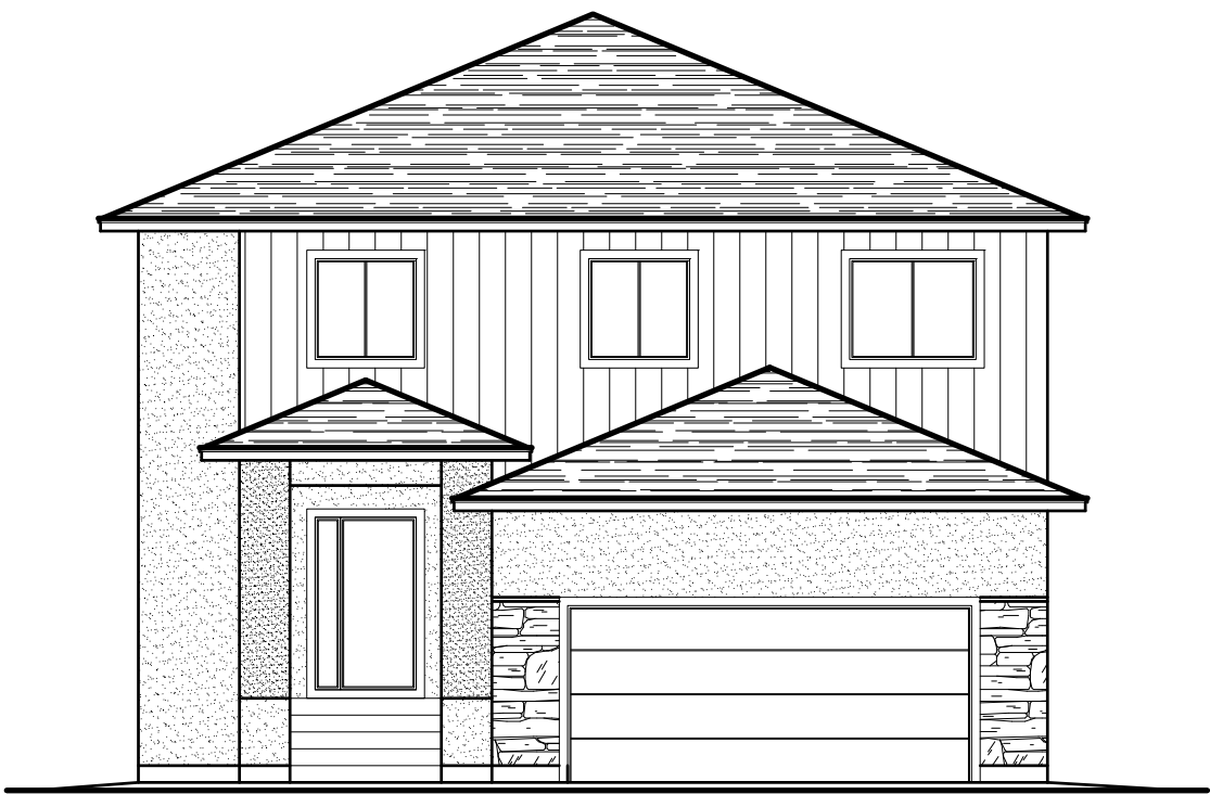
F R O N T E L E V A T I O N