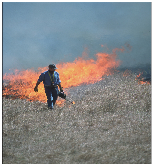
Figure 2 Fire can be used in many settings to encourage forbs that feed and shelter pollinators

State offices also can choose to offer landowners the opportunity to apply for funding to pay a technical service provider to supply guidance under the EQIP conservation practice conservation activity plan (CAP). CAPs address specific conservation needs, including pollinator habitat enhancement (CAP 146). To be most useful, completed CAPs