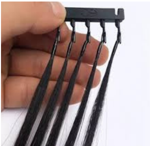
(One panel 6D Extension)