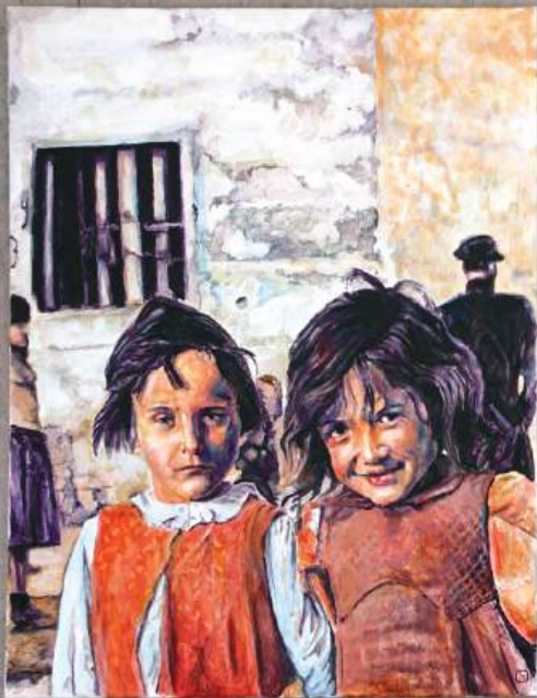
Innocence Roma & Sinti Camp Weyer 2024 Acrylic on canvas 32.62 x 31.49 Inch