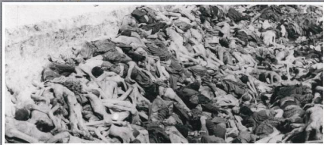
Mass grave of the Bergen-Belsen concentration camp liberated on April 15, 1945.

The sad leader is the conflict between Israel and Hamas in 2023, with 12,300 children killed.