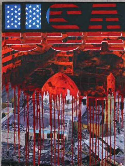
Destruction Mosul 2016-2017 Iraq 2024 Acrylic on canvas 32.62 x 31.49 Inch