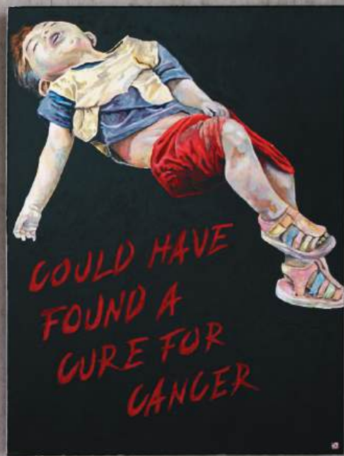
Lost future Dead child Iraq war 2024 Acrylic on canvas 32.62 x 31.49 Inch