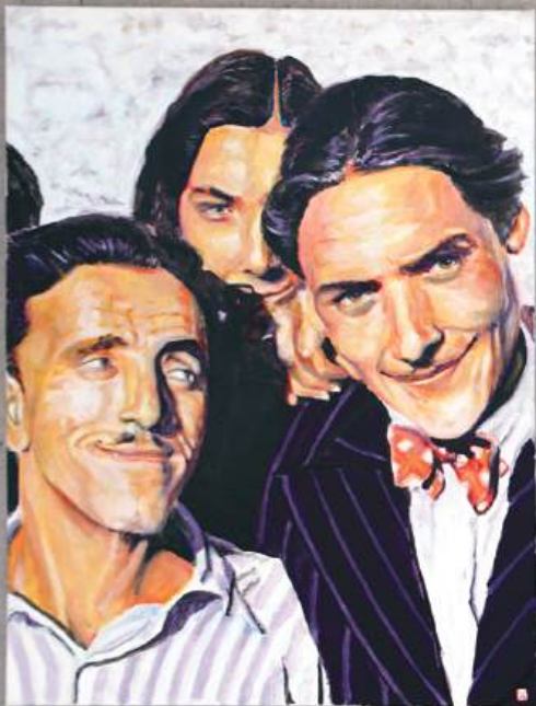
Friends Roma & Sinti Camp Weyer 2024 Acrylic on canvas 32.62 x 31.49 Inch