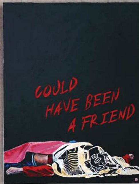
Lost future Festival visitors Israel 2024 Acrylic on canvas 32.62 x 31.49 Inch