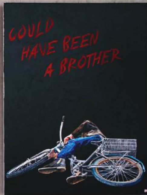
Lost future Death of a cyclist Ukraine 2024 Acrylic on canvas 32.62 x 31.49 Inch