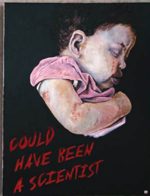
Lost future in her father's arms Gaza Strip 2024 Acrylic on canvas 32.62 x 31.49 Inch