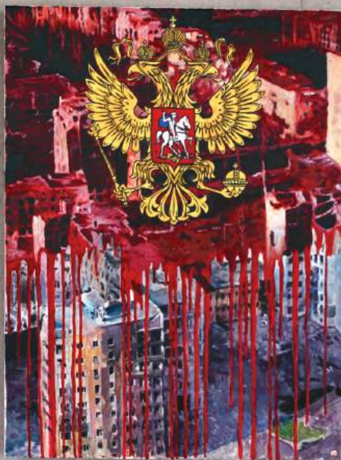
Destruction Mariupol Ukraine 2024 Acrylic on canvas 32.62 x 31.49 Inch