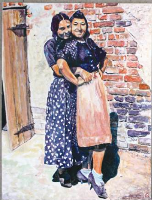
Two women Roma & Sinti Camp Weyer 2024 Acrylic on canvas 32.62 x 31.49 Inch