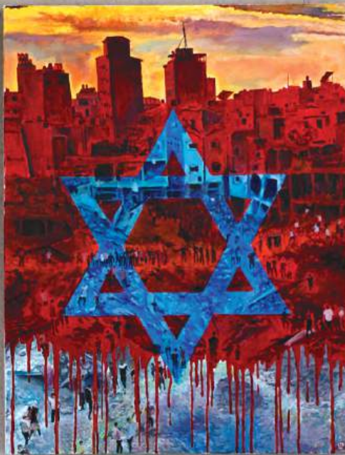
Destruction Gaza Gaza Strip 2024 Acrylic on canvas 32.62 x 31.49 Inch