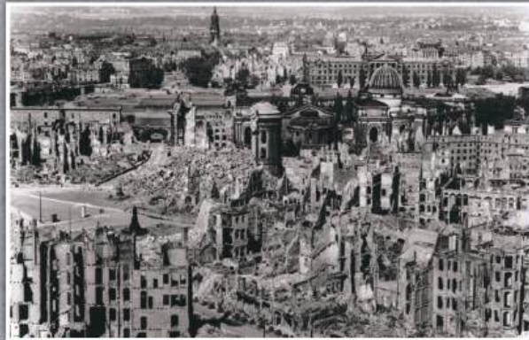
Dresden after the attack on February 13th and 14th, 1945

Since 2000, 140,000 people are died of 61,000 terror attacks, worldwide.