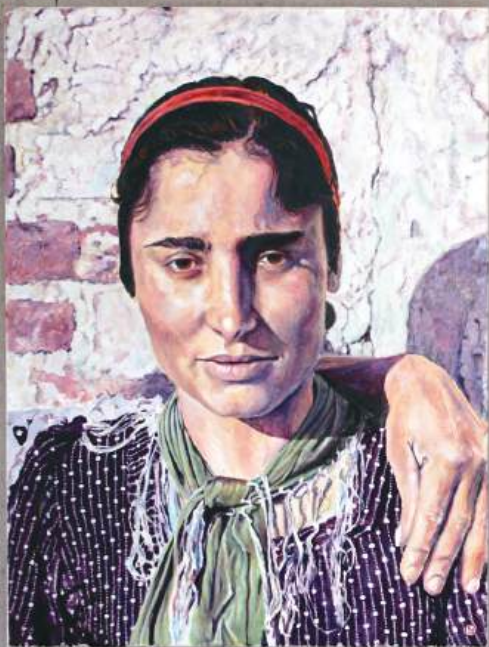
Enclosing hand Roma & Sinti Camp Weyer 2024 Acrylic on canvas 32.62 x 31.49 Inch