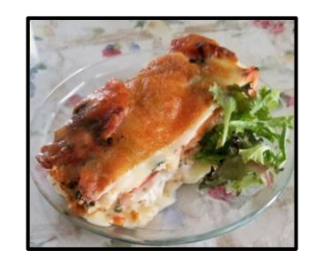
Tomatoes Au Gratin 4.99 Tomatoes, cheese, basil and breadcrumbs layered and baked.