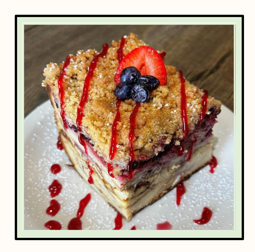
OPEN 7AM – 2PM Voted best Breakfast in Livingston County