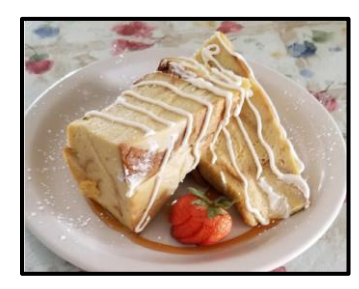
Créme Brulee French Toast

Layered with cinnamon rolls, Texas toast, croissants, blueberries and raspberries topped with streusel 12.99