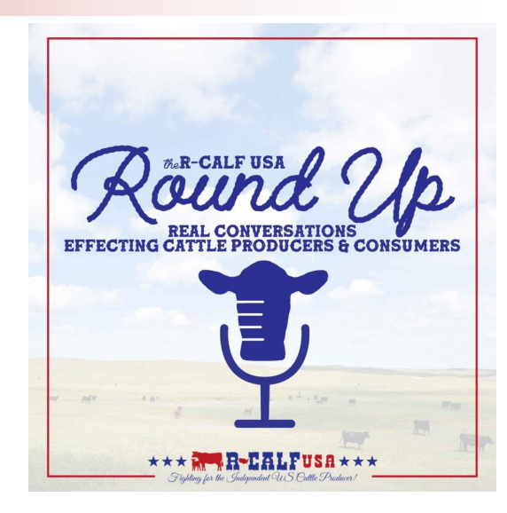
Available on iTunes and Google Play