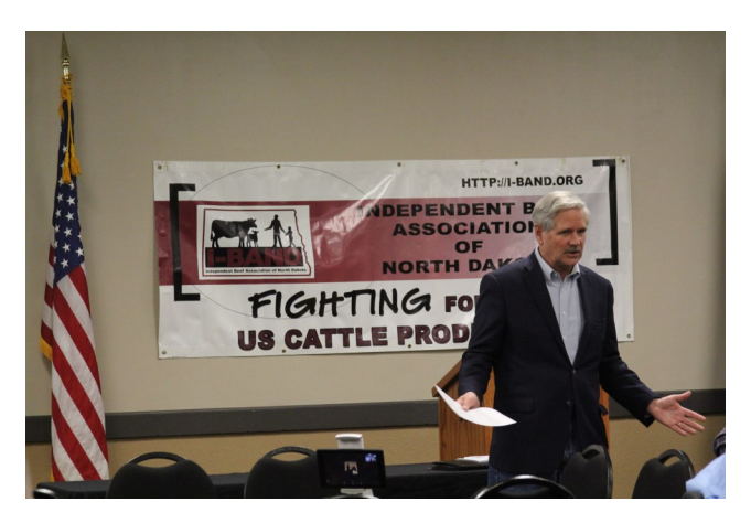
Senator John Hoeven