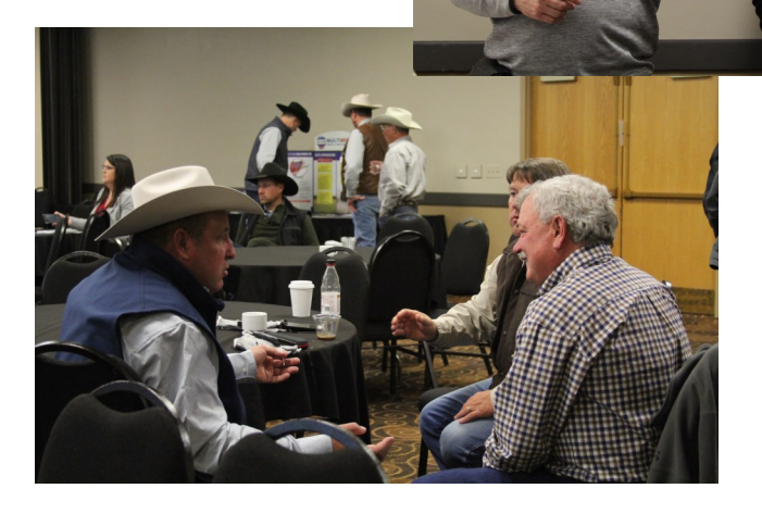
Members listening to the speakers