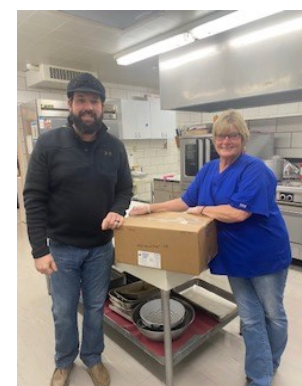
Just a few of the Farm to School deliveries made!