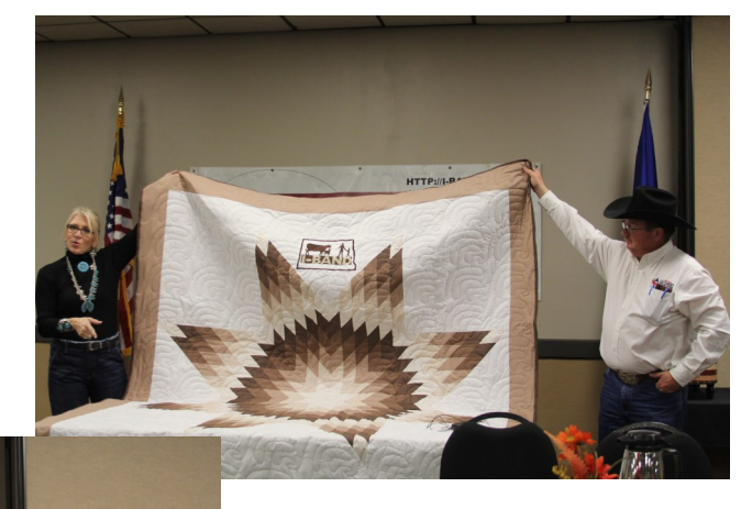
Live Auction. Our Yearly Quilt donated by Becker Ranch, Selfridge, ND