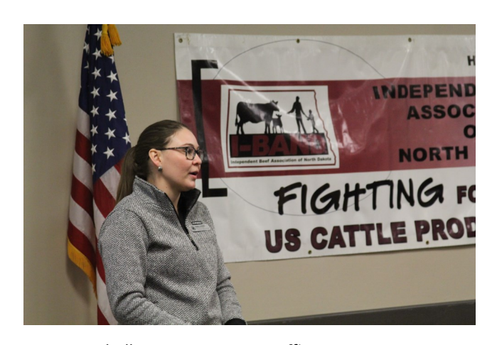
Shelby, Rep Armstrong office