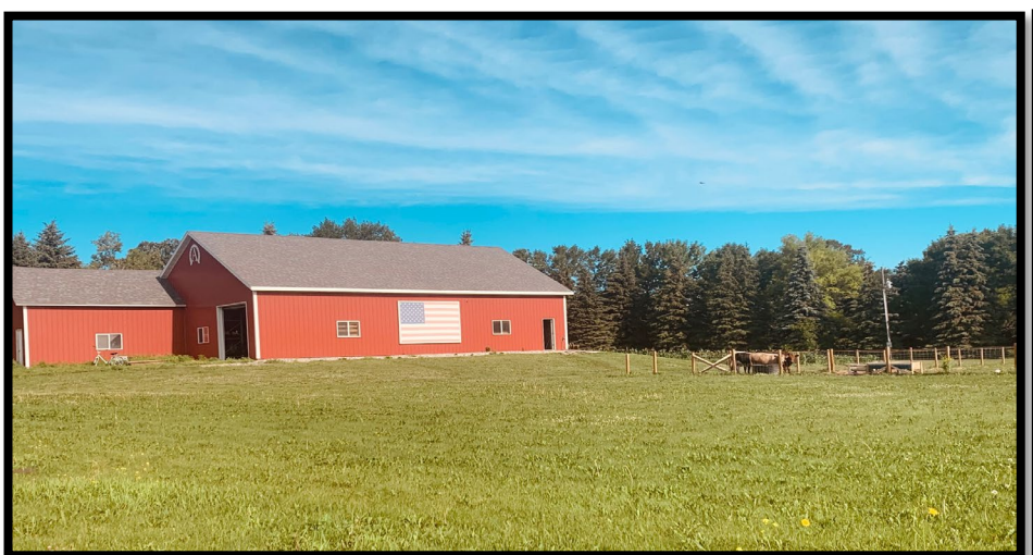
Guaranteed Operating & Ownership