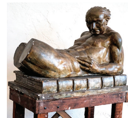
Pauline Ward Mount