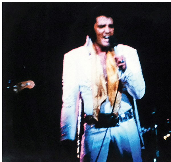
Jonas Mekas, Important Collection of 40 Film Stills – Elvis