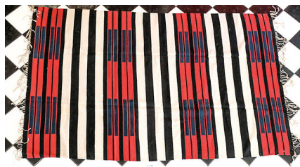
Collection of Rugs