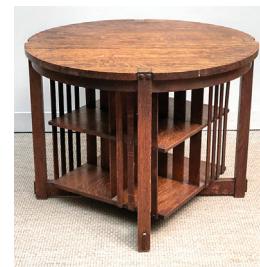
Arts & Crafts Table