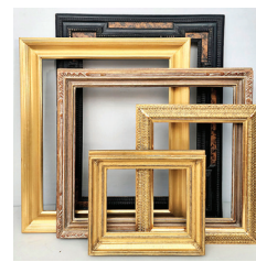
Over 40 Fine Frames

ALL TO BE SOLD WITH NO RESERVE • We are open for in-person bidding! Online bidding through LiveAuctioneers.com, Invaluable.com, and AuctionZip.com