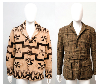
Designer Clothing including Loro Piana and Ralph Lauren