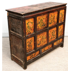
Single Owner Collection of Asian Antiques