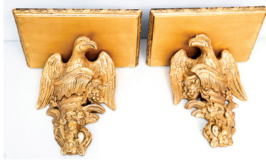
Gilt Wall Brackets