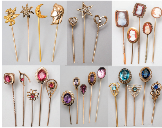
Single Owner Collection of Stickpins