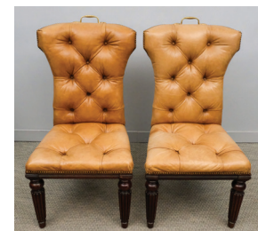
Ralph Lauren Furniture