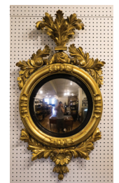
Beautiful Period Convex Mirror

ALL TO BE SOLD WITH NO RESERVE • We are open for in-person bidding! Online bidding through LiveAuctioneers.com, Invaluable.com, and AuctionZip.com