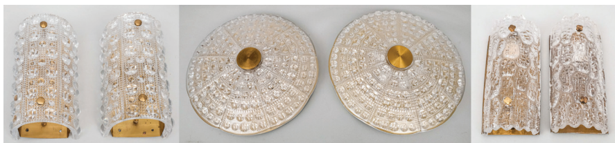
Carl Fagerland Collection