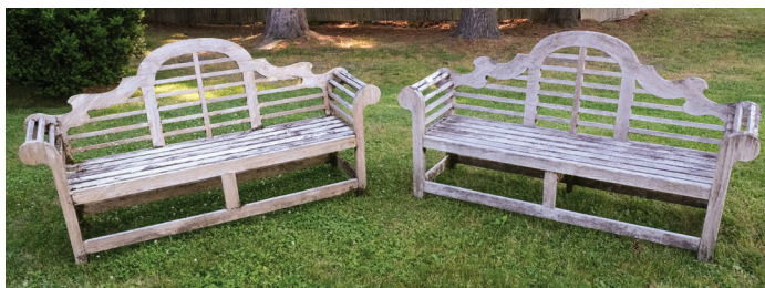
Designer Outdoor Furniture