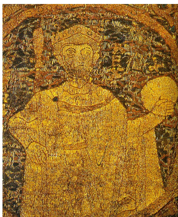
Portrayal of Stephen I on the Hungarian coronation pall

August On August 16 th , the Church honors the blessed memory of Stephen, King of Hungary, who lived in the 11 th century. Born into tribal royalty in what is now the country of Hungary, Stephen was brought up as a Christian by virtue of the fact that his father was a new convert to the Christian faith; thus, his father saw to it that he was educated under the tutelage of Adalbert, bishop of Prague. Succeeding to the throne of his father in 997, he immediately began working for peaceful relations with neighboring states. As he strove to give his people a better life-style, he saw the necessity of rooting out ancient idolatry and educating his subjects in the Christian faith. Since not all of his subjects were enthusiastic about conversion from their past, some rebelled against the throne and met Stephen's forces in battle. Though inferior in number, Stephen was victorious in battle. From this point on, with renewed vigor, many churches, monasteries and schools were founded. In the year 1000, he was crowned as King of the entire Hungarian empire (as was then the custom) by the bishop of Rome. Throughout the rest of his reign, he worked to govern his subjects with Christian humility and for the salvation of their souls. He died on this date in the year 1038.