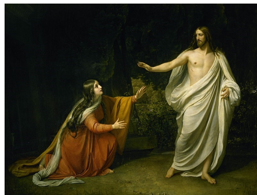
Alexander Ivanov - Christ's Appearance to Mary Magdalene after the Resurrection

July On July 22 nd , the Church honors the blessed memory of one of the close compatriots and disciples of the Lord, Mary Magdalene. Together with Mary, the mother of Jesus, and the disciple John, she was a witness both of the crucifixion and of the resurrection of the Christ. Coming from Magdala, a small town in Galilee, the early Church fathers Clement of Alexandria and Iraneaus identified her with the woman who washed Jesus' feet with her tears. Other ancient Church tradition - though not proven from Scripture - identifies her with the woman who was caught in adultery and was a prostitute before becoming a disciple of Jesus. In France, it was ancient tradition that after the resurrection, she, together others, were expelled from Palestine, and landed at Marseilles, France where she died on this date. She is best remembered as the person who by her love and faith and to the tomb early in the morning of Easter and there saw the promise of Life Eternal in the body of her Savior.