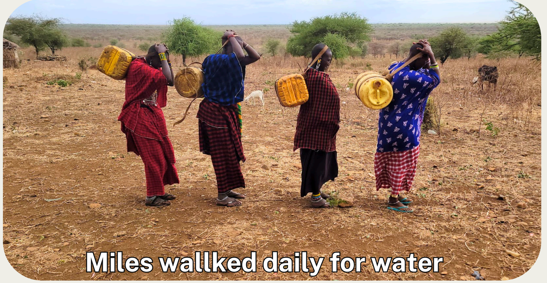
Miles walked daily for water

RIKO is a women-led grassroots initiative working in Esilalei Village, Tanzania , with support from a sister nonprofit in Arizona. Founded by rural women, RIKO equips communities with tools, training, and opportunities that uplift families and strengthen local leadership.