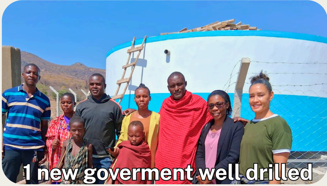
1 new government well drilled

A new government well has recently been drilled in Esilalei, bringing an important step forward for the community.