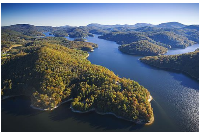
Figure 5. Forested islands and peninsula uplands in Lake Gatun.