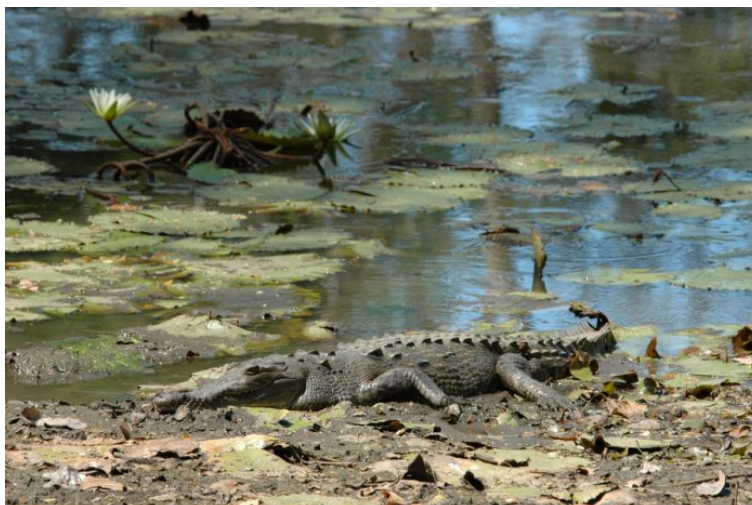
Figure 11. American crocodile in Lake Gatun. Reprinted with permission from Editor of Open Journal of Soil Science.

associated with complex sulfurous minerals made up of sulfur, gold, iron, copper, silver, nickel, antimony and cobalt due to the anionic ion structure being similar to sulfate ( 2\text{SO}_4^- ). Arsenic is a chemical element which occurs in many minerals. Arsenic and its compounds including the trioxide are used in insecticides and pesticides. Arsenical herbicide use is declining due to the toxicity of arsenic and its compounds. Arsenic is the 53rd most common element in nature comprises about 0.00015% of the Earth's crust. Typical background concentrations of arsenic are about 100 mg/kg in the soils, usually less than 10 ug/L in freshwater and 3 ng/m 3 in the atmosphere' [13].