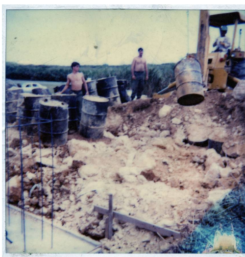
Figure 10. Tactical herbicides barrels being buried by military personnel. Photo Credit: ResearchGate. Reprinted with permission from Editor of Open Journal of Soil Science.