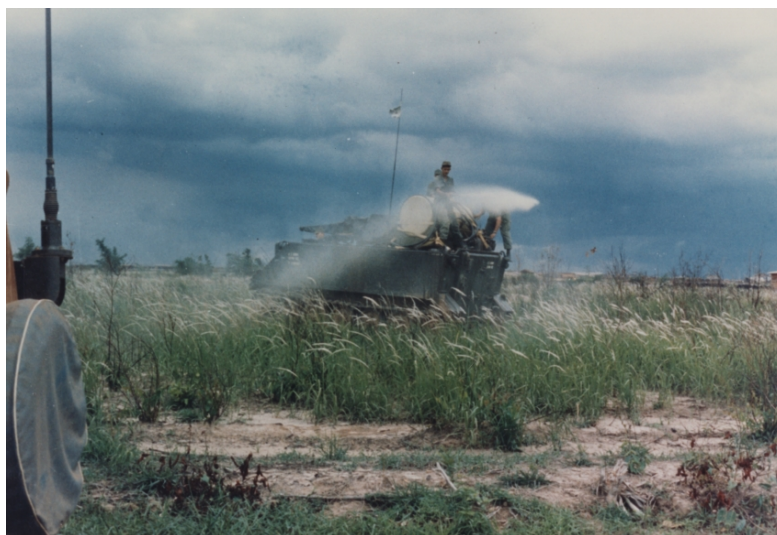
Figure 7. Tactical herbicides sprayed from a vehicle.

Cacodylic acid has been widely used in developed countries in forestry and agriculture for many years prior to the Vietnam War with few known risks to human health [25] [26]. In 1960s and 1970s the US military tested tactical herbicides in Panama Canal Zone [22] [24]. The most likely herbicides tested were probably cacodylic acid, 2,4-D and 2,4,5-T with unknown amounts of dioxin TCDD) [24]. Cristobal and Balboa ports were the port destinations in the Panama Canal Zone which received herbicide shipments for testing and use on military base grounds. Fort Detrick scientists, DOD, CIA, and USDA may have secretly tested cacodylic