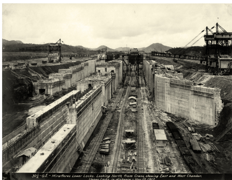
Figure 1. Construction in the early 1910s of a lock on the Panama Canal. Reprinted with permission from Editor of Open Journal of Soil Science.

Commercially available white arsenic was purchased to eliminate the floating plants. White arsenic was mixed with soda bicarbonate and water [10] [11] and applied to the floating plants. In 1914, white arsenic was commercially from multiple sources including the Panama Canal Zone Company or the Naval Depot Supply Federal and Stock Catalog. The Federal Standard Stock Catalog (Procurement Division of the Treasury) was not established until 1935. This arsenic and soda was then sprayed on floating plants including hyacinths. An outfit consisting of a 10 m steam launch with a quarter boat and a pump boat was used [10] [11]. The launch supplied steam to the pump boat and for transportation of men and towing of supplies. The arsenic mixture used was made up of