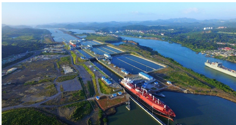
Figure 9. Ships going through a lock near the southern entrance of the Panama Canal.