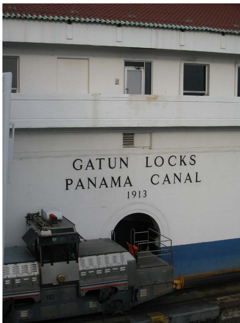
Figure 3. Gatun Locks sign dated 1913 at the Panama Canal dam.