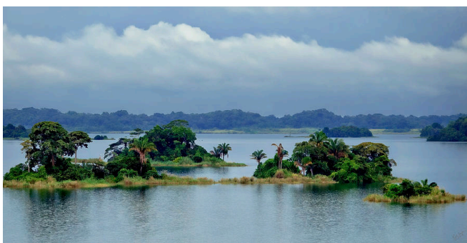
Figure 4. Islands in Lake Gatun which were created in 1913 as a result of Gatun dam.