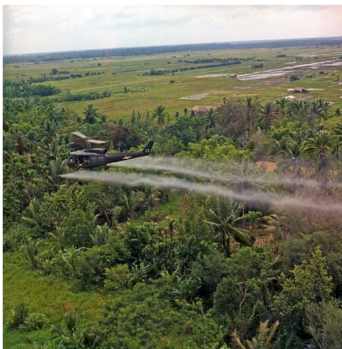
Figure 8. Cacodylic acid being sprayed by arial sprayers.