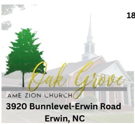
AME ZION CHURCH 3920 Bunnlevel-Erwin Road Erwin, NC