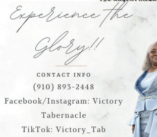
CONTACT INFO (910) 893-2448