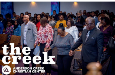
the creek ANDERSON CREEK CHRISTIAN CENTER