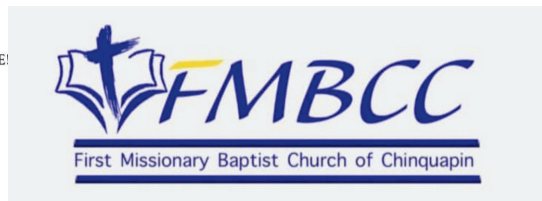
First Missionary Baptist Church of Chinquapin