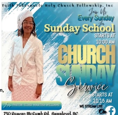
750 Raynor McCamb Rd. Bunnlevel, NC

183 Bailey Way Road, Lillington, NC, (910) 893-5792 lillingtonstar@gmail.com www.lillingtonstar.org