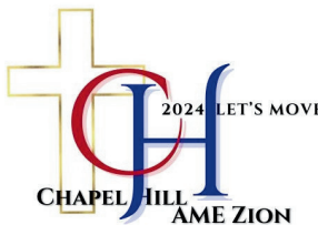
2024 LET'S MOVE!