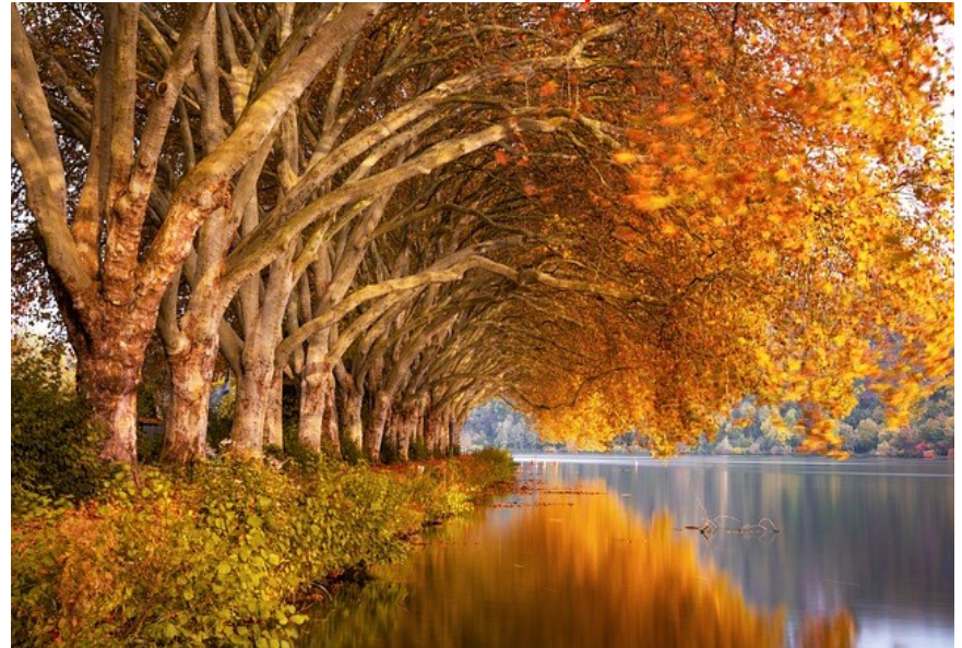
Fall Lake Plane Trees