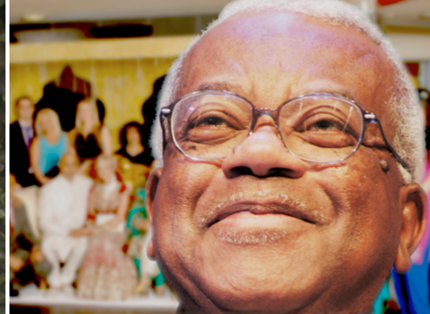
Sir Trevor McDonald