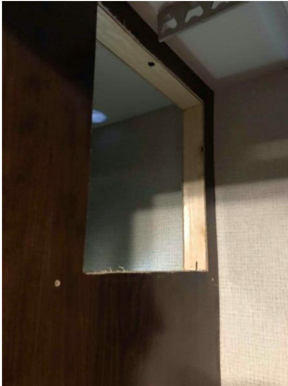
Figure 3: Get enough clothes out of the way to access the panel. Then, remove four screws and take off the panel.

The first step is to remove the access panel from the wardrobe.