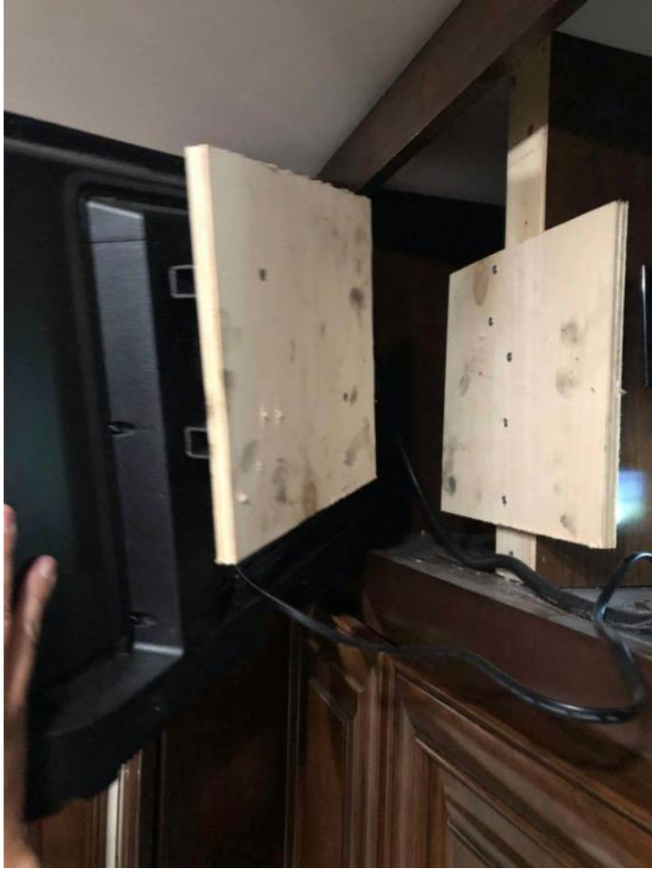
Figure 6: With the screws removed, your partner can pull the TV out.