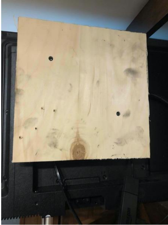
Figure 10: Once firestick is working, have your partner hold the TV in place while you reinstall the four holding screws.