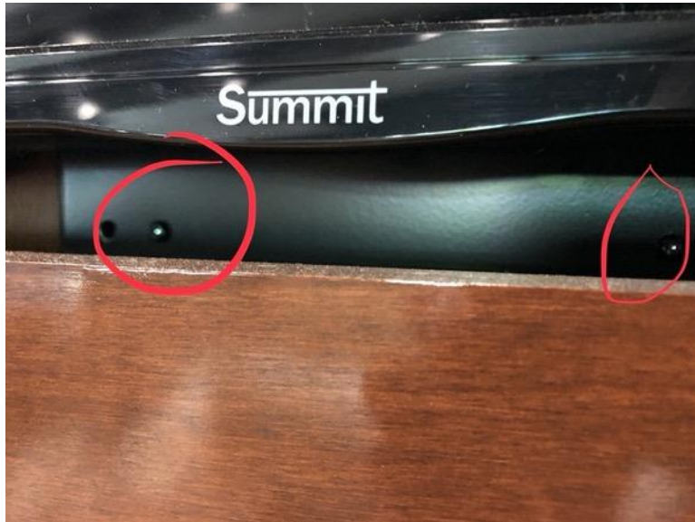
Figure 1: Screw locations on the bottom of the TV mount

To access the ports in the living room TV , four screws must be removed and the TV, while on its mount, can be pulled out and the firestick installed.