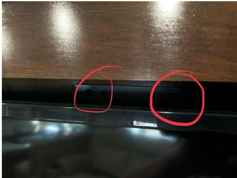
Figure 2: Screw locations on the top of the TV mount