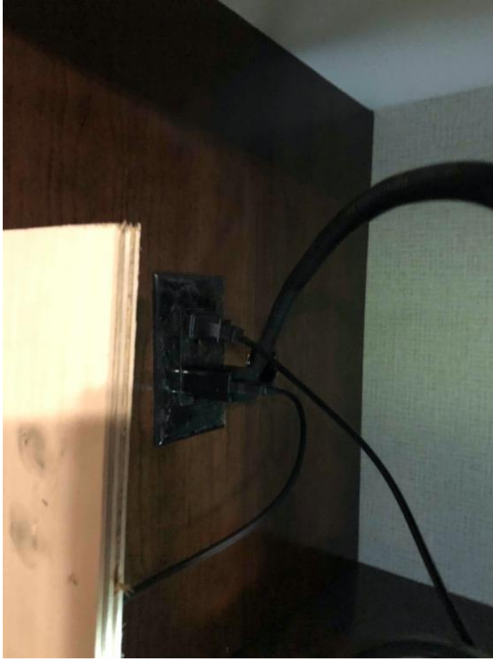
Figure 4: The view after the access panel is removed

With this done, the next step is to remove the four screws holding the television in place. Have your partner hold onto the TV while you remove the screws. Once the four screws are removed, the TV can be pulled out, at which point you can install the firestick into the HDMI port.