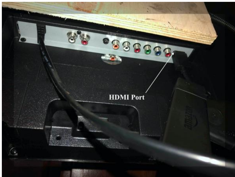
Figure 7: Insert your firestick into the HDMI port as shown.