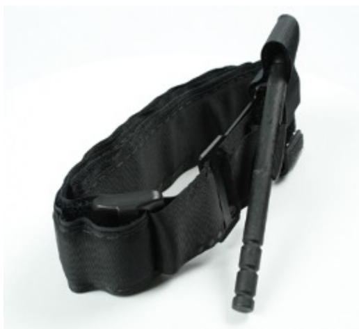
Figure 1: Combat Application Tourniquet