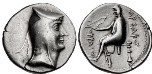
Example with soft cap, Drachm of Arsaces I