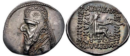
Example with kolah headdress, Drachm of Mithridates II