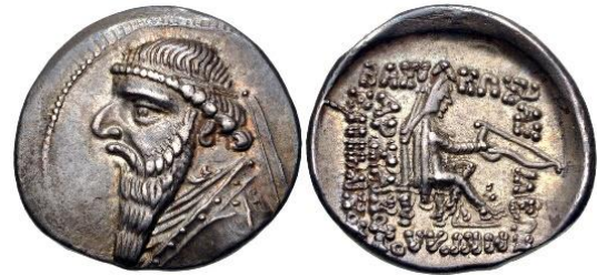
Example with diadem headdress, Drachm of Mithridates II