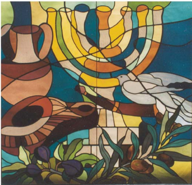
ASHER, 46" x 44" ONE IN A SERIES OF THE TWELVE TRIBES OF ISRAEL, COMMISSIONED FOR TEMPLE BETH EL, APTOS, CA, LEADED CATHEDRAL GLASS