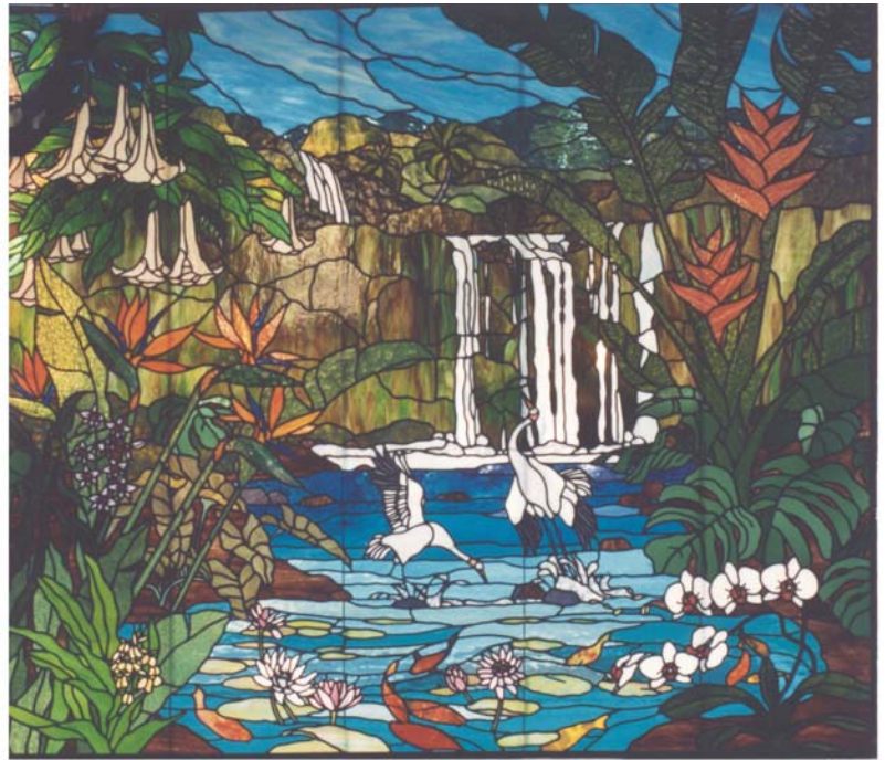
FORBIDDEN PARADISE, 68' x 60' FLORA & FAUNA OF HAWAII FOR PRIVATE MAUI RESIDENCE, OPALESCENT & DOUBLE-GLAZED GLASS

RENAISSANCE GLASSWORKS IS PROUD TO CARRY ON THE TRADITIONS OF TRUE GLASS ARTISANS. WORKING CLOSELY WITH OUR CLIENTS, WE APPLY INTERIOR DESIGN EXPERTISE AND AESTHETIC SENSIBILITIES TOWARD DESIGNING CUSTOMIZED, ONE OF A KIND ART GLASS TO COMPLIMENT AND ENHANCE RESIDENCES, COMMERCIAL OR RELIGIOUS INSTITUTIONS. USING A SPECTRUM OF OPALESCENT, PEARL, CATHEDRAL COLORED OR CLEAR TEXTURED ART GLASS, LUMINOUS STATEMENTS MAY GRACE ENTRY DOOR SIDELIGHTS, TRANSOMS, IN-DOOR PANELS, SKYLIGHT, CEILING AND WALL PANELS, A CENTERPIECE FOR AN ILLUMINATED FOCAL POINT, OR LITURGICAL THEMES LINING THE INTERIOR OF A HOUSE OF WORSHIP.