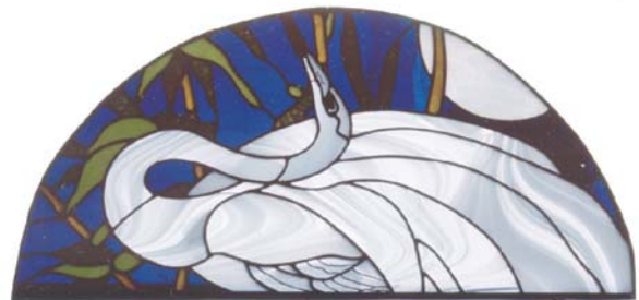
EGRET NESTLED AMONGST BAMBOO 14" HIGH x 26" WIDE