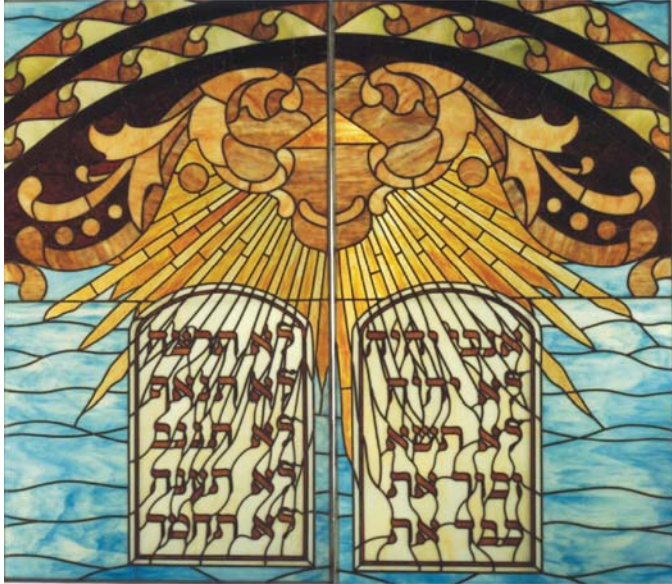
RECONSTRUCTION/REDESIGN OF TORAH DOORS FOR TEMPLE BETH EL, APTOS, CALIFORNIA, TOTAL SIZE 6 FOOT SQUARE