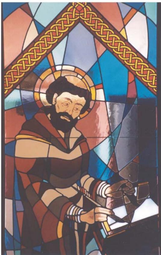
ST. BEDE'S EPISCOPAL CHURCH, MENLO PARK, CA. 27' x 84' ONE OF EIGHT PANELS OF 4TH - 6TH CENTURY SAINTS OF THE BRITISH ISLES. (EIGHT MORE PANELS OF MODERN AMERICAN SAINTS ARE CURRENTLY IN DEVELOPMENT)