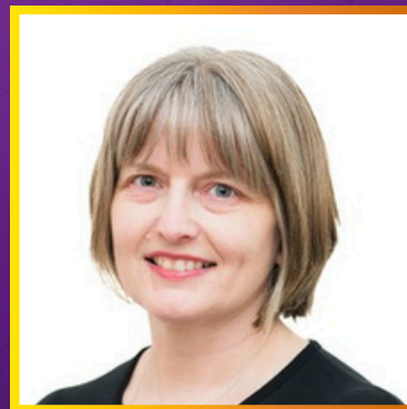
Millie the Maid