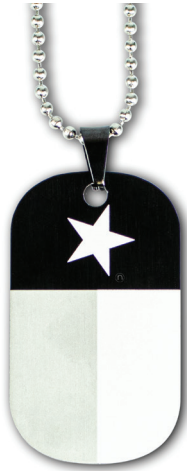
TEXAS NO: DT003