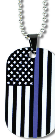
THIN BLUE LINE NO: DT007