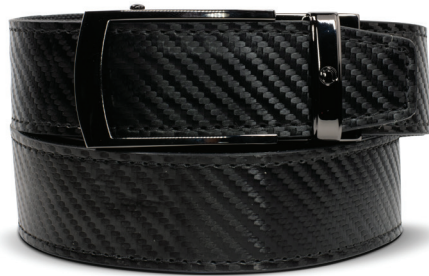
BOND CARBON BLACK | NO: PCS5772