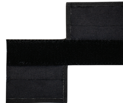
INNER BELT WRAP