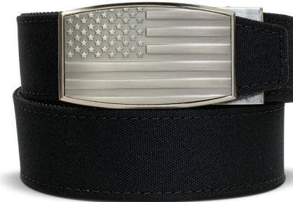
ASTON USA EMBOSSED 1.5" | NO:PCS3163