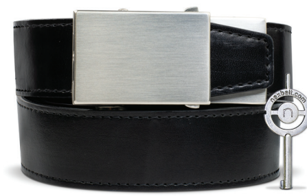
CUFF KEY BELT 1 3/8" | NO: PCS6809