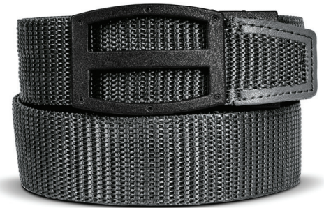
TITAN GREY XL | NO: PCS3396