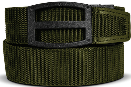
TITAN GREEN | NO: PCS3303