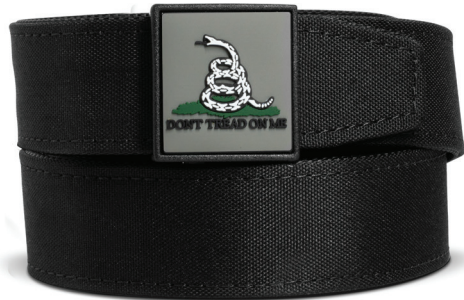
GADSDEN SUPREME | NO: PCS9688