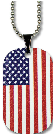
USA COLOR NO: DT004