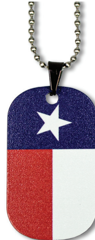
TEXAS COLOR NO: DT006