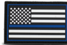
THIN BLUE LINE PVC PATCH NO: CGP0046