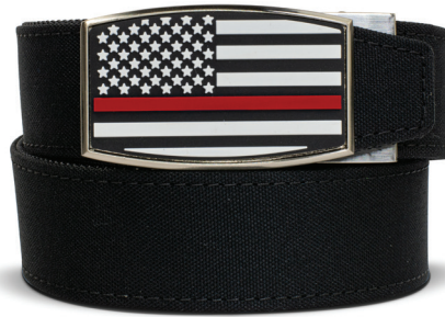
ASTON THIN RED LINE 1.5" | NO: PCS3149