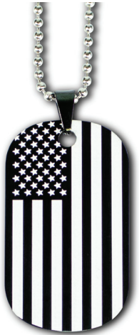
USA NO: DT001