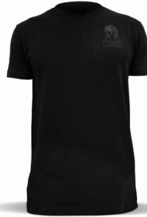
FRONT NEXBELT NATION T-SHIRT BLACK Medium | Large | XL