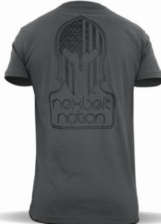
BACK NEXBELT NATION SHIRT GREY Medium | Large | XL