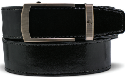
BOND BLACK | NO: PCS5741

Buckle size 1 5/8" H by 2 5/16" W. Belt strap is 1 3/8" H. Fits up to 50" waist