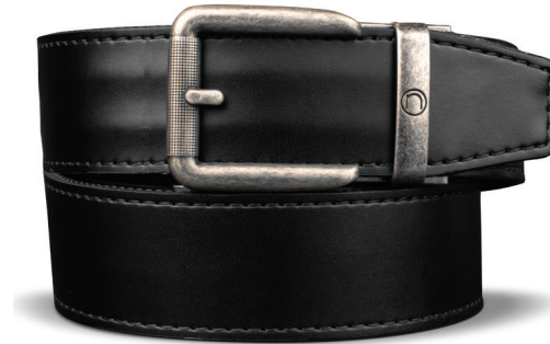
ROGUE BLACK | NO: PCS3310