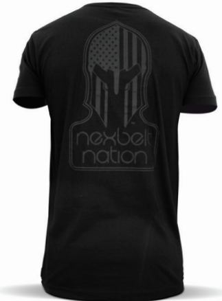
BACK NEXBELT NATION T-SHIRT BLACK Medium | Large | XL