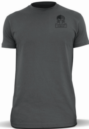
FRONT NEXBELT NATION SHIRT GREY Medium | Large | XL