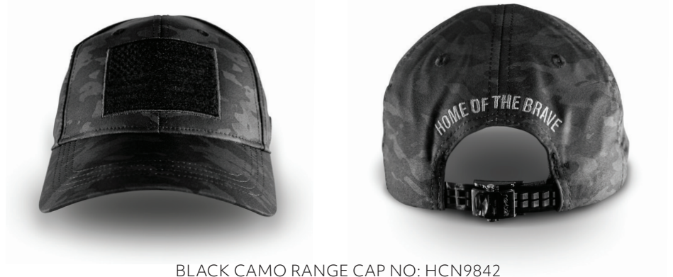
BLACK CAMO RANGE CAP NO: HCN9842