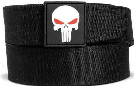
PUNISHER SUPREME | NO: PCS9664