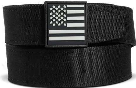
USA SUPREME | NO: PCS9671

Buckle size 1 11/16" H by 1 3/4" W. Belt strap is 1 1/2" H. Fits up to 50" waist