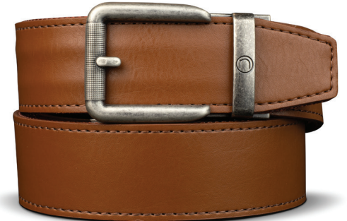
ROGUE WALNUT | NO: PCS3440