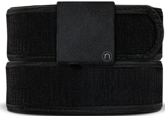
INNER HOOK & LOOP SUPREME | NO: PCS3118