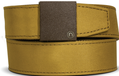
SUPREME COYOTE | NO: PCS6854