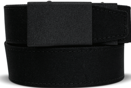
GUARDIAN BLACK | NO: PCS8452