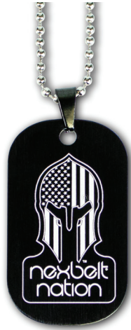
SPARTAN NO: DT002