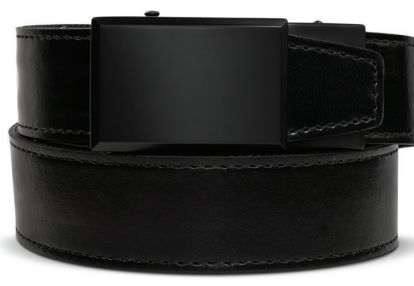
DARKNITE 1 3/8" | NO: EIS0001