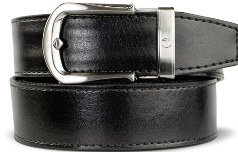
FRANCES BLACK | NO: PCS6915