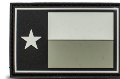
TEXAS PVC PATCH NO: CGP0047