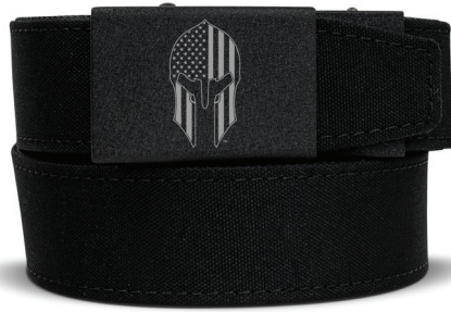
GUARDIAN SPARTAN 1.5" | NO: PCS7622