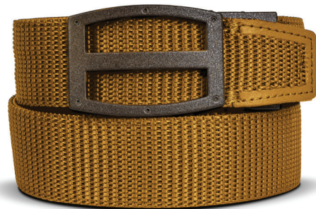
TITAN COYOTE | NO: PCS2122