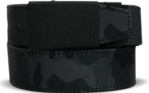
GUARDIAN BLACK CAMO | NO: PCS7653