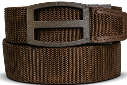
TITAN BROWN | NO: PCS3273