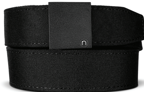
SUPREME BLACK XL | NO: PCS3217