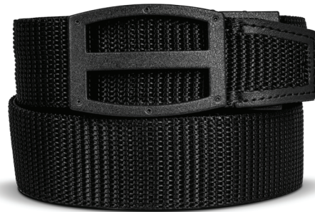
TITAN BLACK XL | NO: PCS3389