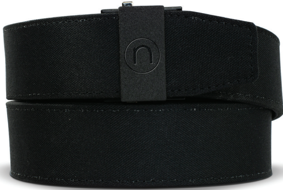
NTAC-45 | NO: PCS9121

This belt is designed for heavy duty loads. The strap is 1 3/4" wide and the buckle uses a double trigger mechanism with an upgraded heavy duty track system. We built a safety feature where both triggers must be pushed to release the strap. The belt is 1 3/4" wide and works great with a battle belt. Buckle size 2" H by 1 3/4" W, Belt strap is 1 3/4" H. Fits up to 50" waist.