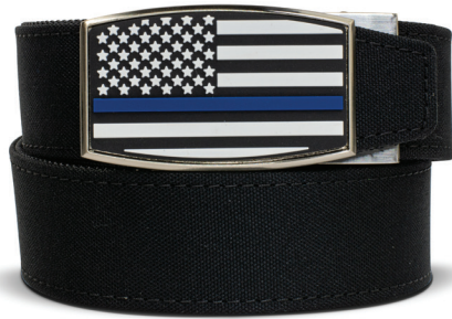
ASTON THIN BLUE LINE 1.5" | NO:PCS3156

We offer a great selection of designs of buckles . If you're a fan of the police or fire department, we have you covered with our rubberized plates that resist abrasion and will last for years. Another unique product not to be missed is our Cuff Key Belt which has an ejecting cuff key from the buckle face. Buckle face varies in size. Strap sizes come in 1 1/2" and 1 3/8". Please note that strap heights are noted with name. Fits up to 50" waist.