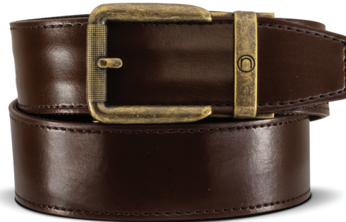
ROGUE ESPRESSO | NO: PCS3327