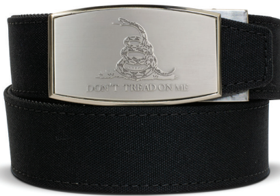
ASTON GADSDEN 1 3/8" | NO: PCS3170