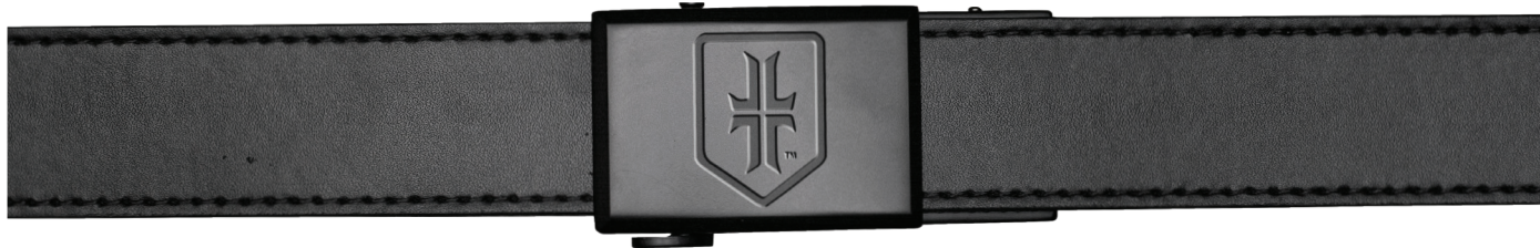
WARRIOR POET SOCIETY

CORNER LASER ETCH: SUPREME BUCKLE W/ GRANITE BROWN POWDER COAT FINISH