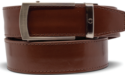
BOND BROWN | NO: PCS5710