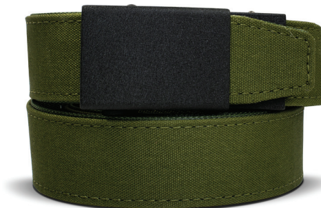
GUARDIAN OD GREEN | NO: PCS7646