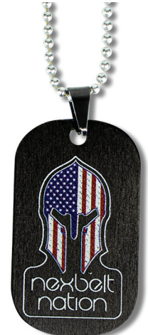
SPARTAN COLOR NO: DT005