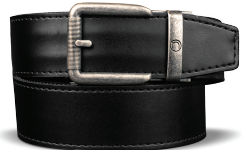
ROGUE BLACK XL | NO: PCS3372