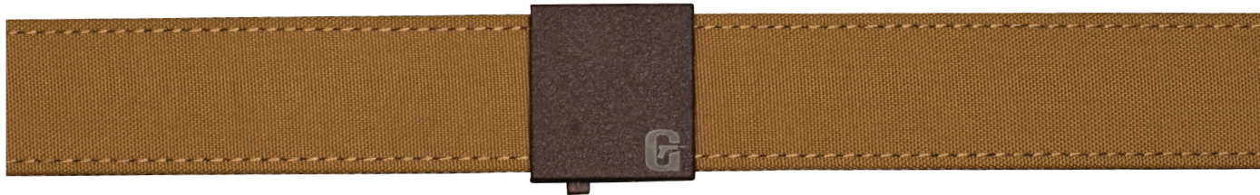
BLACK AND GOLD GUY

CORNER EMBOSSED: SUPREME BUCKLE W/ SLATE FINISH