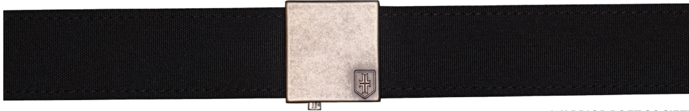
WARRIOR POET SOCIETY

We specialize in customizing our belts for business, schools and charities. They make great gifts for employees and are a wonderful marketing tool to say thank you to your customers or vendors. Contact us for pricing: sales@nexbelt.com