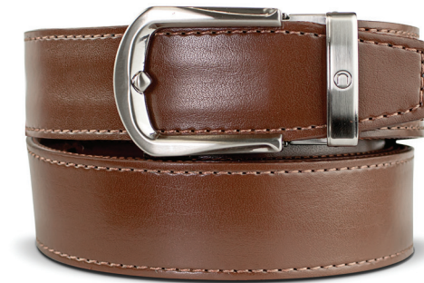
FRANCES BROWN | NO: PCS6922