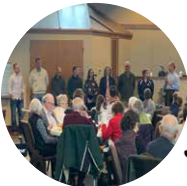
New council members getting installed in the Fellowship Hall at the Annual Meeting on January 27.