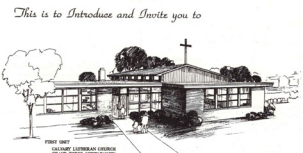
CALVARY LUTHERAN CHURCH 15th Avenue South and South Ninth Street, Grand Forks, North Dakota A FRIENDLY CHURCH SERVING CHRIST AND YOUR COMMUNITY