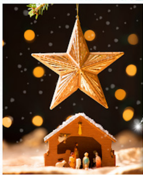
4 & 5 Year Old Milestone Event