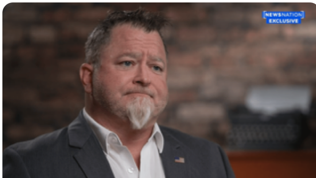
Ex-Pentagon official alleges US has recover... nonhuman specimens thehill.com