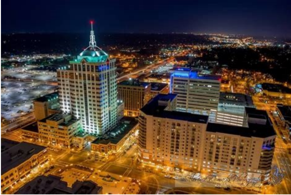
Virginia Beach Town Center