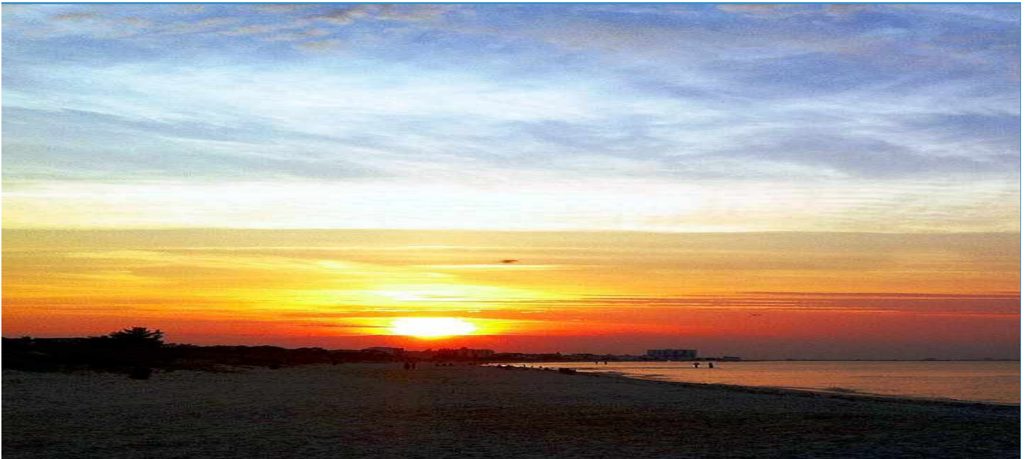
Red at night - VB delight!