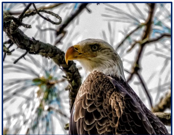
Bald Eagle taken on Thalia Point