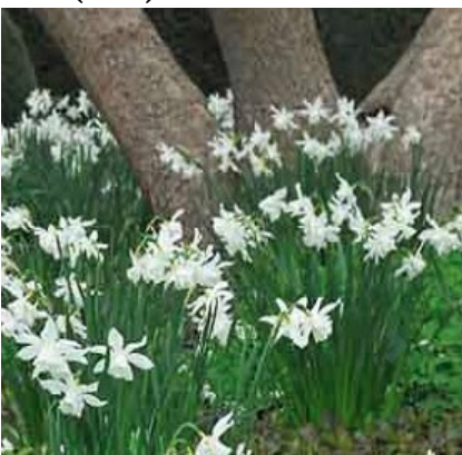
Fragrant Daffodil "Thalia"

President, Thalia Garden Club (757) 340-0167