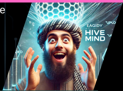
"One AI to rule them all!"

Believes in the eventual rise of a super-intelligent AI capable of either saving humanity or converting everyone into paperclips. They eagerly anticipate their robot overlord's benevolent dictatorship. "Yes, AI will turn us all into demigods, and no, there's no downside. Exactly like in the movies, but without the evil robots... hopefully."