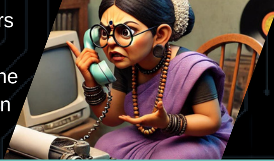
"Keep it classic, keep it analog!"

Rejects AI entirely and longs for the days of typewriters and rotary phones. This tribe is often found at flea markets hunting for vinyl records. The retro rebels of the digital age. "Why settle for a digital copy when you can have the real thing? Long live vinyl and pinball!"