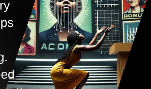
"In Maths we Trust!"

Fascinated by algorithms and their potential to optimize every aspect of life, from cooking to relationships. This tribe worships algorithms and treats AI models like celebrity idols. These people believe that there's a perfect algorithm for everything. "Love life in a mess? Try our new dating algorithm! Guaranteed 99.9% match rate, or your heartache back!"