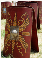
Spiritual Warfare: Unveiling the Armor of God