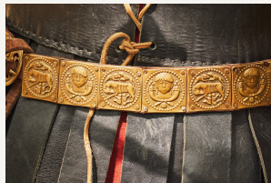
Spiritual Warfare: Unveiling the Armor of God

25 But whoso looketh into the perfect law of liberty, and continueth therein, he being not a forgetful hearer, but a doer of the work, this man shall be blessed in his deed