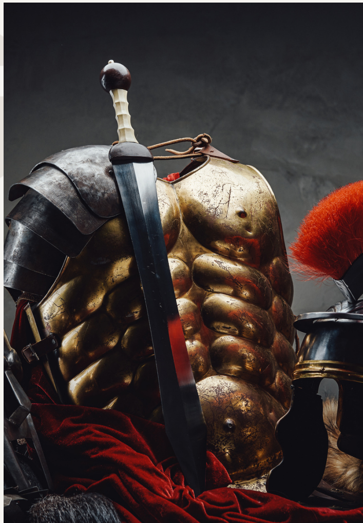
Spiritual Warfare: Unveiling the Armor of God

Throughout this study, we have explored the transformative power of the armor of God and its significance in our spiritual journey. May you go forth equipped, ready to face the challenges of life with the full armor of God, trusting in His strength and guidance