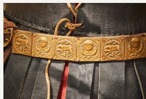
Spiritual Warfare: Unveiling the Armor of God

7 But if we walk in the light, as he is in the light , we have fellowship one with another, and the blood of Jesus Christ his Son cleanseth us from all sin.