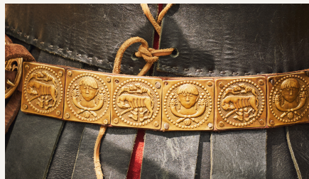
Spiritual Warfare: Unveiling the Armor of God