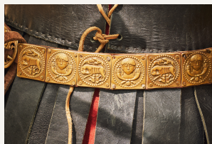
Spiritual Warfare: Unveiling the Armor of God