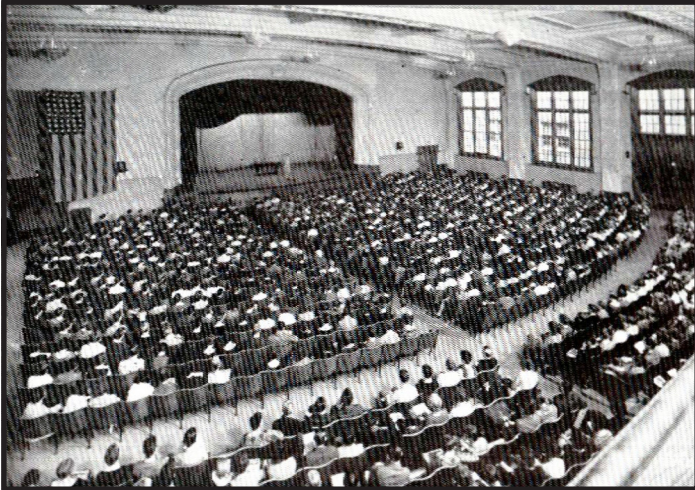
Riverside Auditorium, 1931

The Riverside University High School Foundation has decided to conduct a capital fundraising campaign to bring the school's auditorium acoustics up to date. When the current school building was constructed in 1917, providing an auditorium wherein students could showcase their artistic talents was a central focus. In the nearly 100 years since the school was built, the auditorium has been used by thousands of Riverside students for debates, band concerts, orchestra concerts, one-act plays, three-act plays, musicals, student meetings, parent meetings, community meetings, all-school assemblies, recitals, rallies and much more.