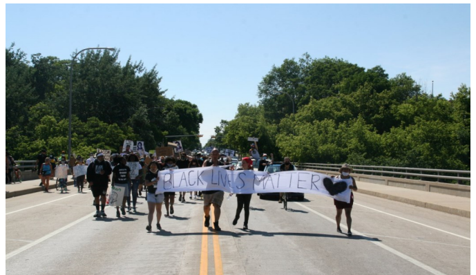
BLM protestors marching on Locust Street on Day 37 after George Floyd's death.

We salute the students and staff of RUHS for doing their part to make our community and world a better, more just one.