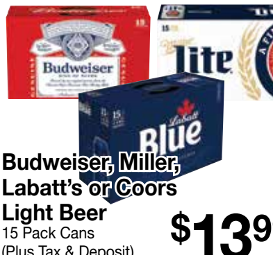
Budweiser, Miller, Labatt's or Coors Light Beer 15 Pack Cans (Plus Tax & Deposit)