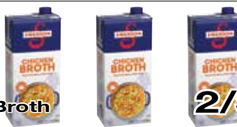
Swanson Chicken Broth 32 oz.