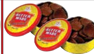
Better Made Chocolate Covered Potato Chips 7 oz.