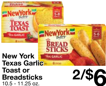
New York Texas Garlic Toast or Breadsticks 10.5 - 11.25 oz.