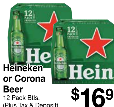
Heineken or Corona Beer 12 Pack Btls. (Plus Tax & Deposit)