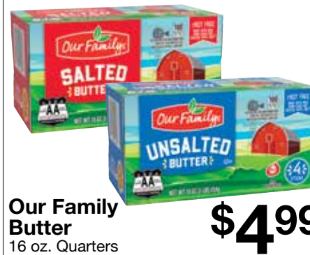
Our Family Butter 16 oz. Quarters