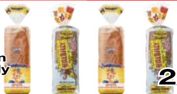
Sunbeam or Hillbilly Bread 20 - 22 oz.