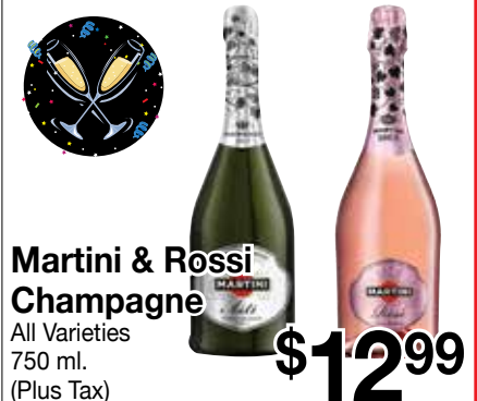
Martini & Rossi Champagne All Varieties 750 ml. (Plus Tax)