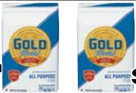
Gold Medal Flour 5 lb.