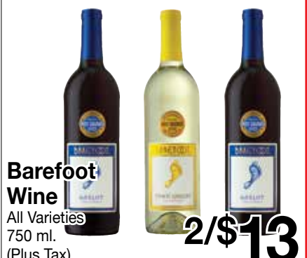
Barefoot Wine All Varieties 750 ml. (Plus Tax)