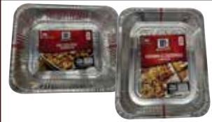
McCormick Aluminum Pans All Sizes