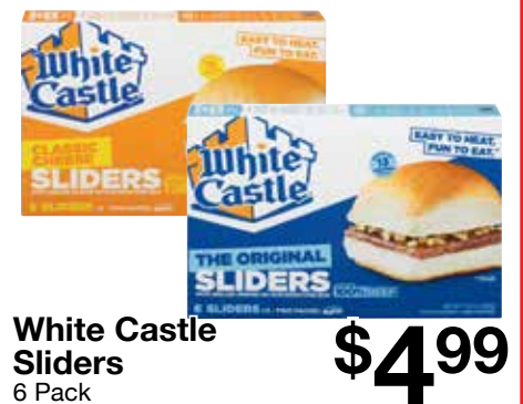
White Castle Sliders 6 Pack