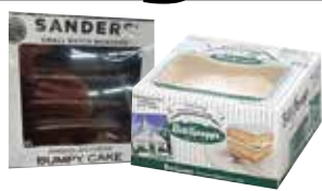
Bill Knapp's Celebration Cake 25 oz. or Sander's Bumpy Cake 25 oz.