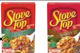
Stove Top Stuffing Mix All Varieties 6 oz.