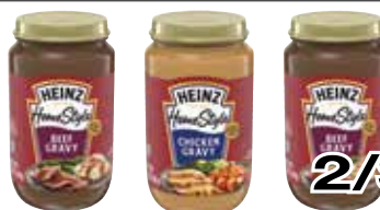
Heinz Gravy All Varieties 12 oz.