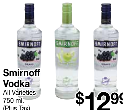
Smirnoff Vodka All Varieties 750 ml. (Plus Tax)