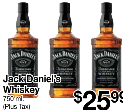
Jack Daniel's Whiskey 750 ml. (Plus Tax)