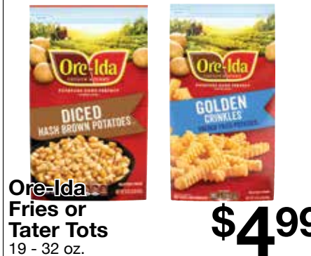
Ore-Ida Fries or Tater Tots 19 - 32 oz.