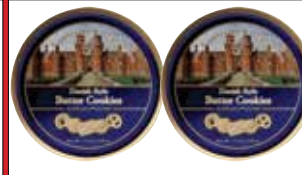
Cambridge & Thames Danish Cookies 12 oz.