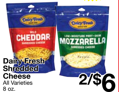
Dairy Fresh Shredded Cheese All Varieties 8 oz.