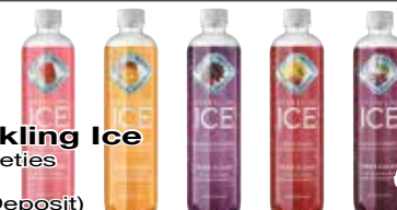
Sparkling Ice All Varieties 17 oz. (Plus Deposit)