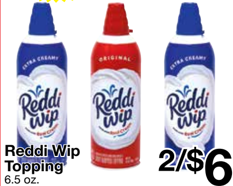
Reddi Wip Topping 6.5 oz.