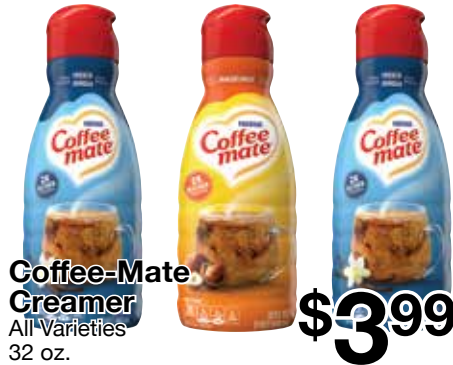
Coffee-Mate Creamer All Varieties 32 oz.