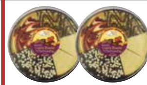
Father's Table Variety Cheesecake 32 oz.