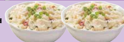
Macaroni & Cheddar Salad