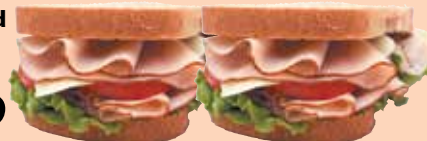
Boar's Head Vermont Cheddar Cheese