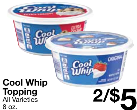
Cool Whip Topping All Varieties 8 oz.