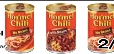
Hormel Chili All Varieties 15 oz.