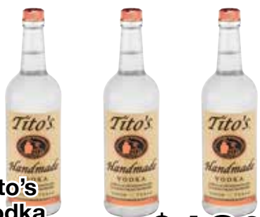
Tito's Vodka 750 ml. (Plus Tax)