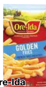
Ore-Ida Fries or Tater Tots 28 - 32 oz.