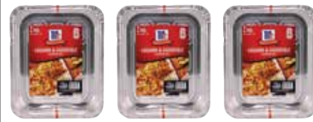
McCormick Aluminum Pans All Varieties 1 or 2 Pack