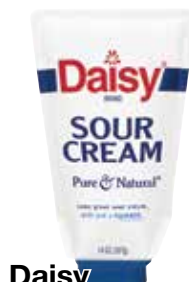
Daisy Squeeze Sour Cream 14 oz.