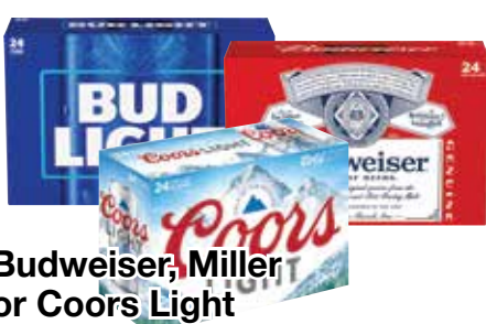
Budweiser, Miller or Coors Light Beer 24 Pack, 12 oz. Cans (Plus Tax & Deposit)