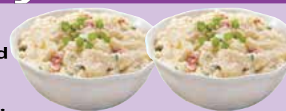
Store Made Pasta Salad