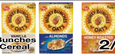
Post Honey Bunches of Oats Cereal 11 - 12 oz.