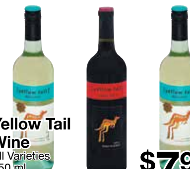
Yellow Tail Wine All Varieties 750 ml. (Plus Tax)