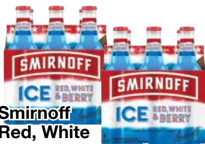
Smirnoff Red, White & Berry 6 Pack Btls. (Plus Tax)