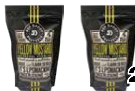
Pop Daddy Pretzels All Varieties 7.5 oz.