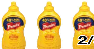
French's Mustard 20 oz.