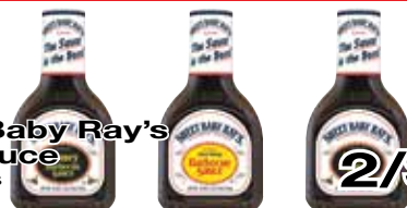
Sweet Baby Ray's BBQ Sauce All Varieties 18 oz.