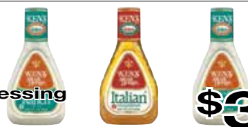
Ken's Salad Dressing All Varieties 16 oz.