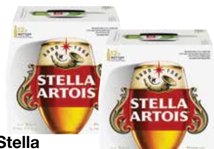
Stella Beer 12 Pack Btls. (Plus Tax & Deposit)