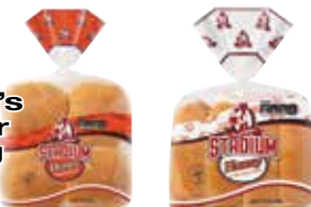
Aunt Millie's Hamburger or Hot Dog Buns 8 ct.