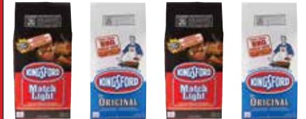
Charcoal Now Available