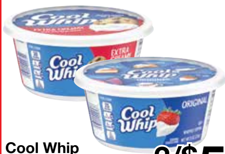
Cool Whip Topping 8 oz.