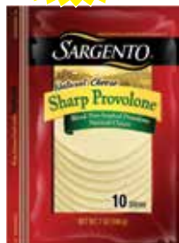
Sargento Sliced Cheese 10 ct.