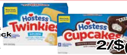
Hostess Multi Pack Cakes All Varieties 8 - 10 ct.