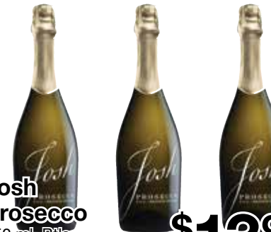
Josh Prosecco 750 ml. Btls. (Plus Tax)