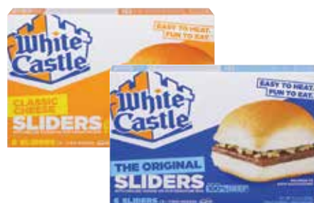
White Castle Sliders 6 ct.