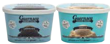
Guernsey Ice Cream All Varieties 48 oz.