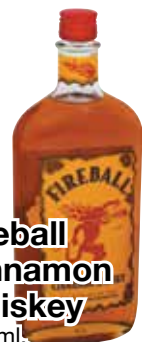
Fireball Cinnamon Whiskey 750 ml. (Plus Tax)