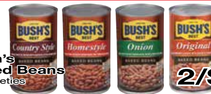
Bush's Baked Beans All Varieties 28 oz.