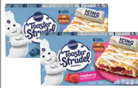
Pillsbury Toaster Strudel 11.7 oz.