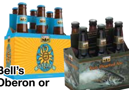
Bell's Oberon or Two Hearted 6 Pack Btls. (Plus Tax & Deposit)