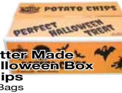
Better Made Halloween Box Chips 32 Bags