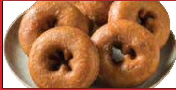
Cider Donuts 10 ct.