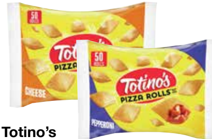
Totino's Pizza Rolls All Varieties 50 ct.