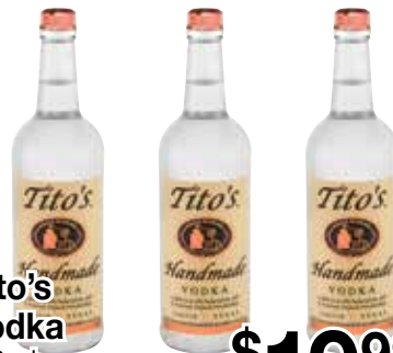
Tito's Vodka 750 ml. (Plus Tax)