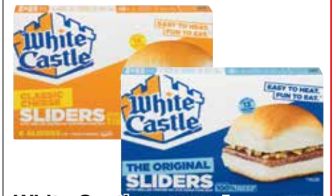
White Castle Sliders 6 Pack