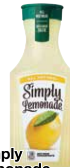
Simply Lemonade 52 oz.