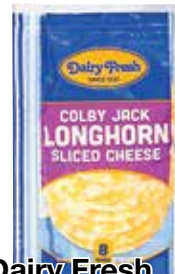
Dairy Fresh Sliced Cheese All Varieties 8 ct.