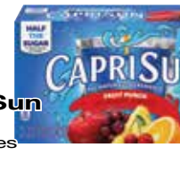
Capri Sun Drinks All Varieties 10 ct.