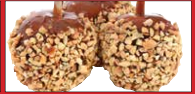
Caramel Apples 3 ct.