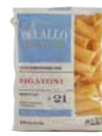
Delallo Pasta All Varieties 16 oz.