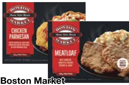
Boston Market Dinners All Varieties 13 - 14.5 oz.