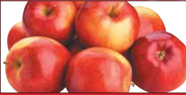
Honey Crisp Apples