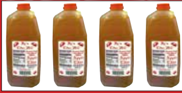
Hy's Apple Cider Half Gallon