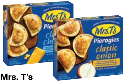
Mrs. T's Pierogies All Varieties 12.84 - 16 oz.