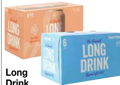
Long Drink All Varieties 6 Pack Cans (Plus Tax)