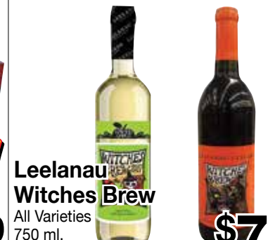
Leelanau Witches Brew All Varieties 750 ml. (Plus Tax)