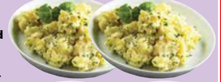
Store Made Pasta Salad