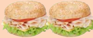
Boar's Head Sharp Wisconsin Cheddar Cheese