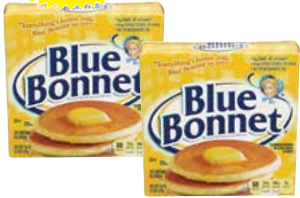
Blue Bonnet Spread 16 oz. Quarters