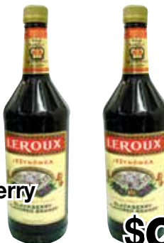
Leroux Polish Blackberry Brandy 750 ml. (Plus Tax)