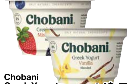
Chobani Greek Yogurt All Varieties 5.3 oz.