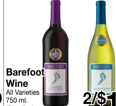
Barefoot Wine All Varieties 750 ml. (Plus Tax)