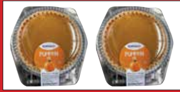
Sabrina's Pumpkin Pie 22 oz.