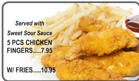
Served with Sweet Sour Sauce 5 PCS CHICKEN FINGERS.....7.95 W/ FRIES.....10.95