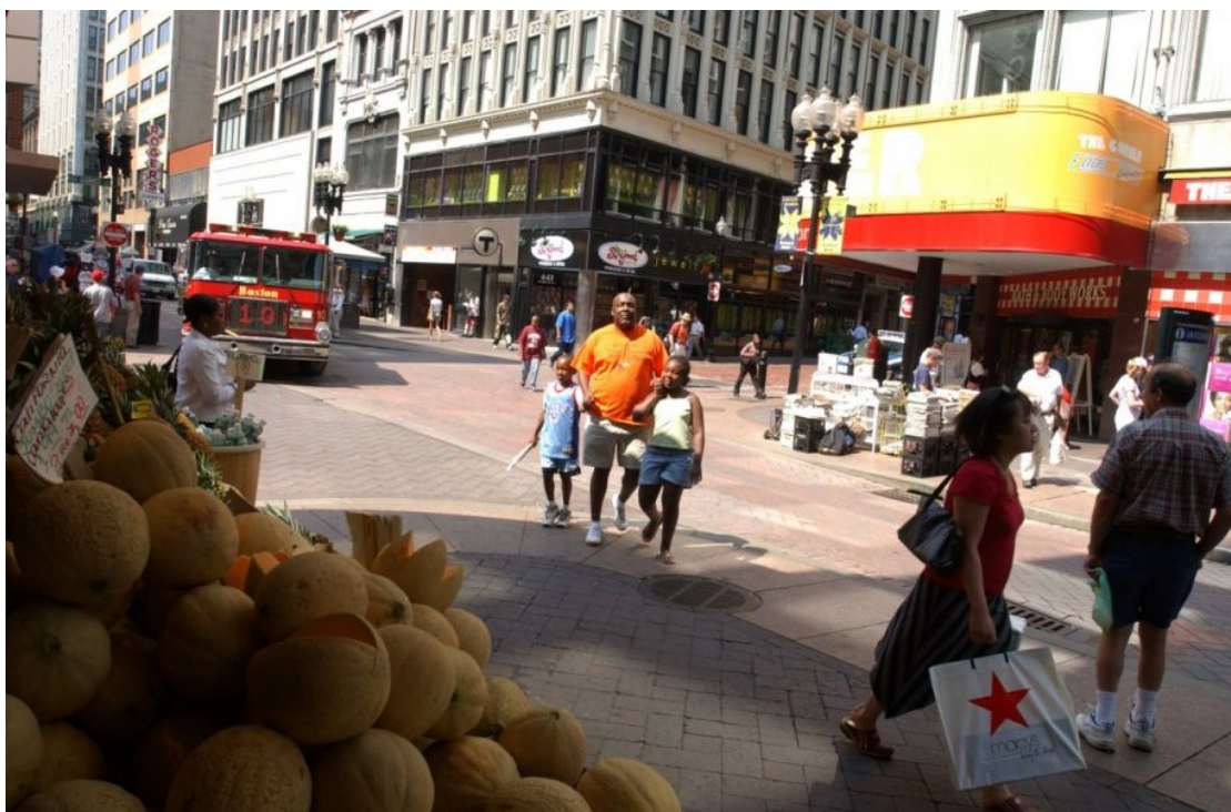
Pedestrians stroll through Boston's Downtown Crossing.

B ikes might be hogging the trend spotlight these days, but cities are smart to cater to those who move by shoe.