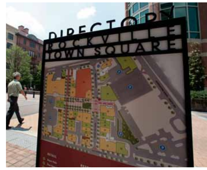
MODERN LIVING: Rockville Town Square in Maryland offers a good mix of business, shopping and living options, July 28, 2010.

Then, 15 years ago, Rockville convened hearings and forums to discuss its lackluster downtown, deciding in the end to replace it with a town square lined with shops, restaurants and apartments, all steps away from a subway station -- in other words, more of an urban experience.