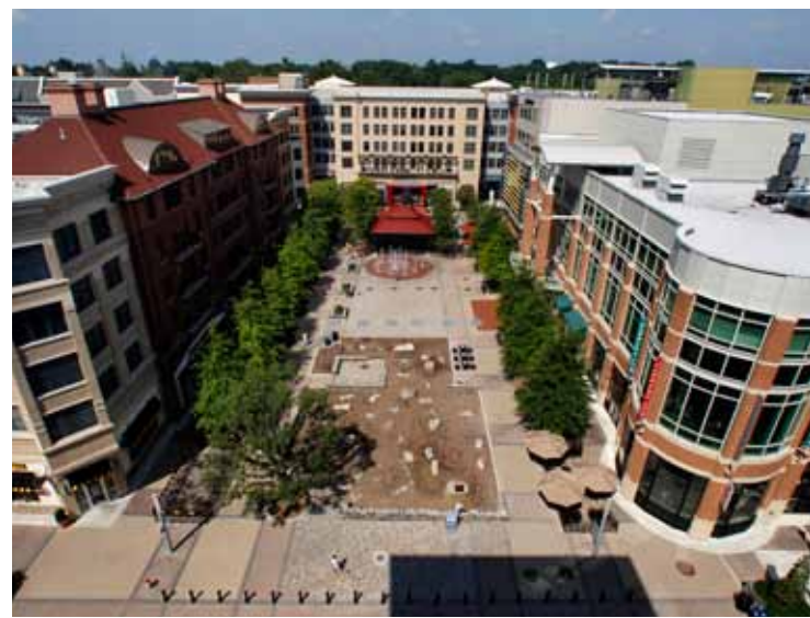
OUT OF THE DESERT: Magruder's Mall (left) was part of Rockville's sprawling downtown, which languished for 40 years. After the city's renaissance, the new Rockville Town Center (right) is a thriving downtown in an easily walkable area. July 17, 2008.