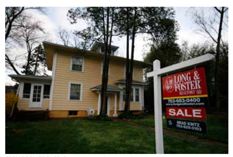
FROM BOOM TO BUST: Since the housing bust, single family homes are no longer the easy option like they were for baby boomers in the twentieth century, July 27, 2010.

He says the previous model was based on the assumption that the United States could prop up the single family home in a distant location by keeping the cost of oil and mortgages low. But that era is over. "The true cost of transportation and housing is going to start to surface," he warns.