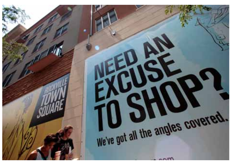
NO MORE EXCUSES: Rockville, Maryland successfully created a go-to place for its residents for everything from free concerts and breakdancing to business networking and power lunching, July 28, 2010.

COVER PHOTO: The new Rockville Town Square in Maryland is a mix of shops, facilities, businesses and apartments. Rockville underwent a renaissance over the past four years, becoming an icon of the shift toward urban-style living. July 28, 2010.