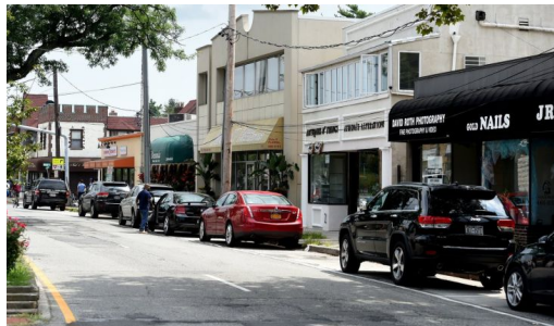
A view looking south on Middle Neck Road in Great Neck. Great Neck is Long Island's most walkable community, according to a George Washington University study.