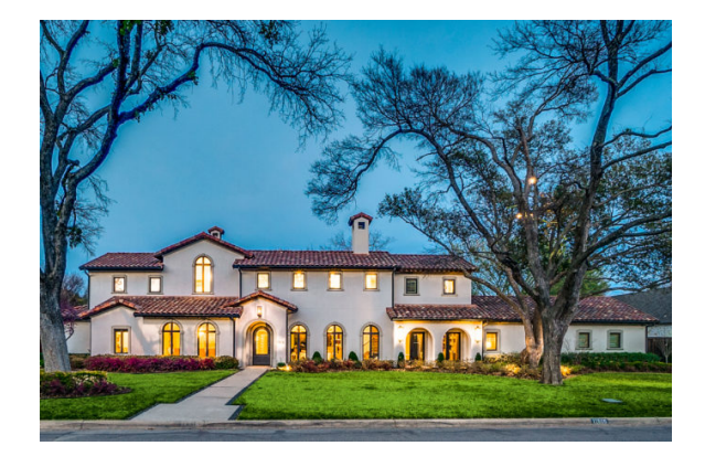
PARTNER CONTENT Preston Hollow Home Offers