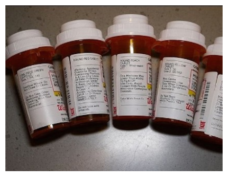
4 Worst Blood Pressure Drugs SIMPLE BLOOD PRESSURE FIX