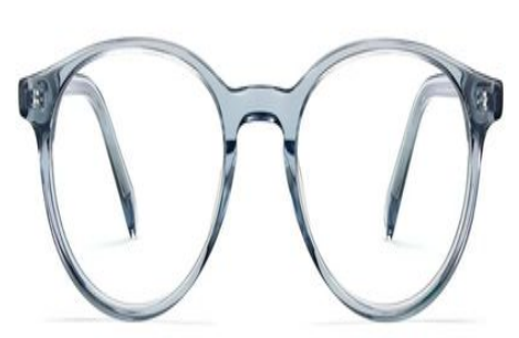
Shop Watts From Warby Parker WARBY PARKER