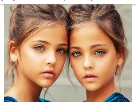
These Twins Were Named "Most Beautiful in the World," Wait Till You See Them Now GIVEITLOVE