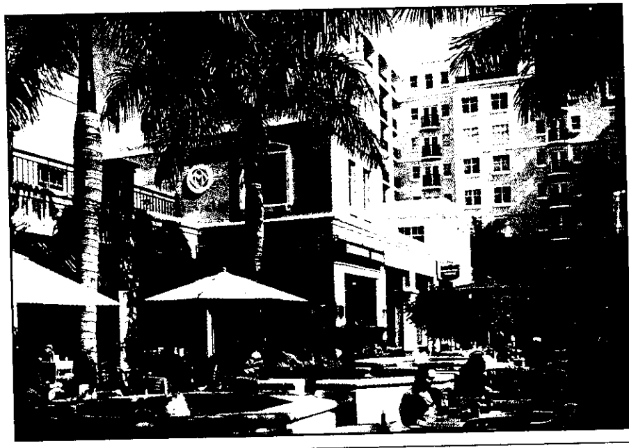
Mizner Park. A new mode of successful investment modeled on old patterns of development.

Investors in the first tranche who want to get in and out within five years, for example, receive the bulk of the cash flow during a project's first five years. Given that they employ DCF methodologies, they probably do not value midto long-term cash flows. The percent of projected cash flow is determined by the amount required to achieve, for instance, a 20 percent IRR on invested equity.