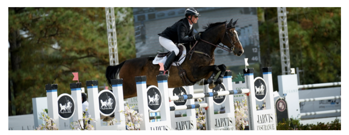
SPLIT ROCK AIKEN CSI2* 06/Nov - 10/Nov AIKEN, SC

Rounding out 2024, & the start of the 2025 USEF calendar are Equus Events Inc. December Classics December 5 - 8 & December 12 - 15