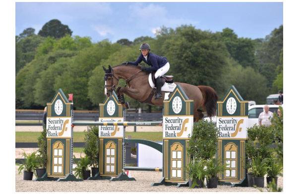
Security Federal Bank