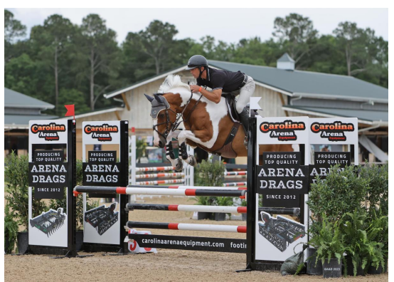
Carolina Arena Equipment