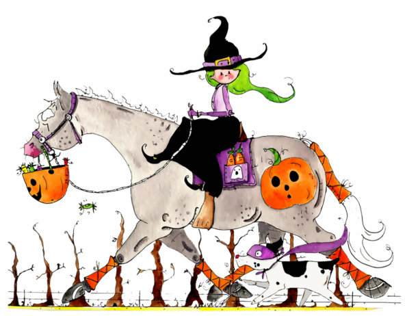
Horses are the treat. (Riding is the trick.)

Running in conjunction with the Halloween Costume Class, we will also hold the Pups in the Park Costume Class sponsored by Aiken Saddlery! Turn your pooches into pumpkins and join us for the frightening festivities.