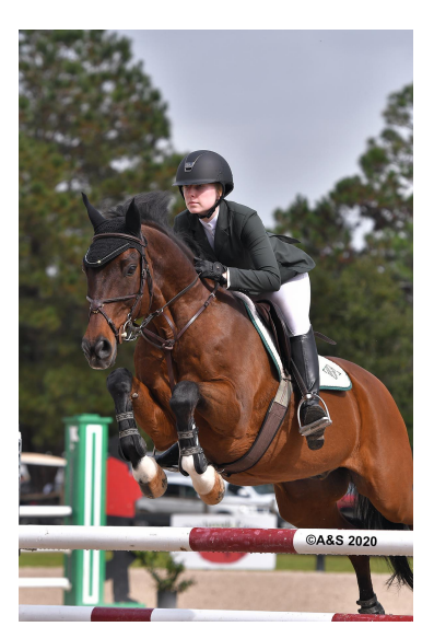
$3,000 JR/AM JUMPER 1.20M CLASSIC Sponsored by Barb Gould Uskup