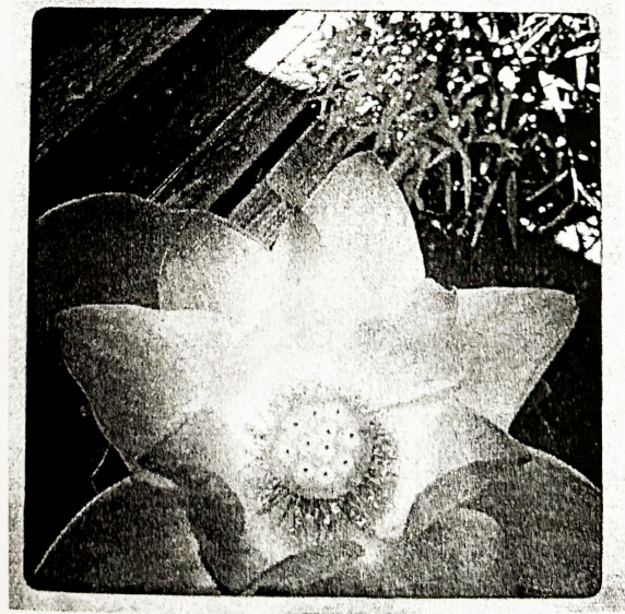
Lotus Flower, Asheville, North Carolina. 2011

life unfurls in time it fades retreats within