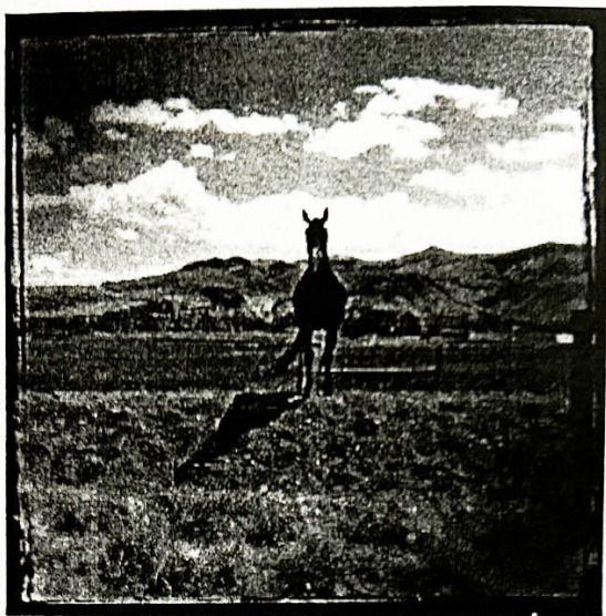
Lone horse in Idaho. 2012

“ a zine (an abbreviation of the word fanzine , or magazine; pronounced zēen ) is most commonly a small circulation publication of original or appropriated text and images. More broadly, the term encompasses any self-published work of minority interest, usually reproduced via photocopier. ”