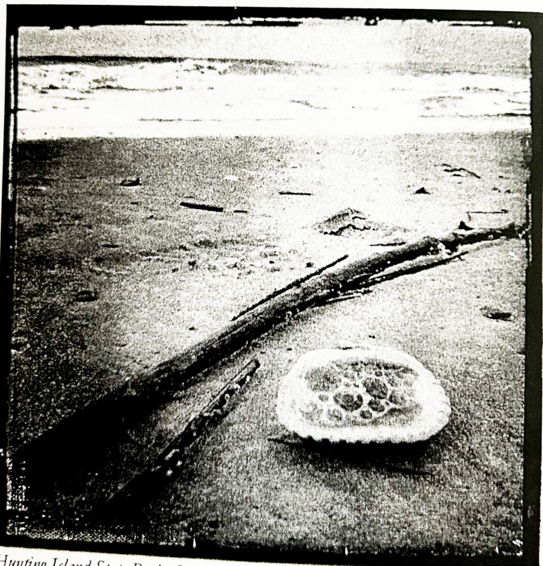
Hunting Island State Park, South Carolina. 2012

http://www.merriam-webster.com/dictionary/villanelle