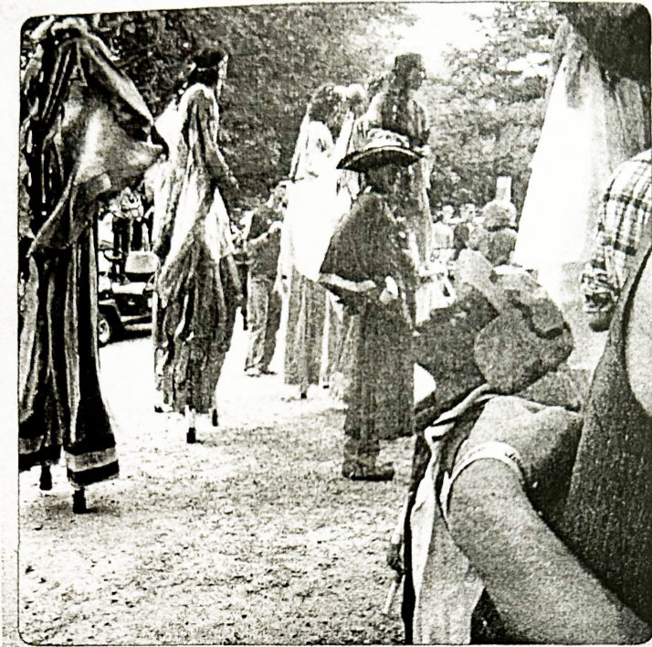
Kid's Parade, Leaf Festival. Black Mountain, North Carolina. 2012