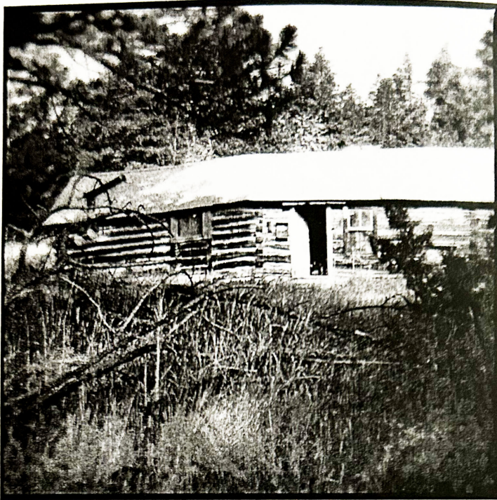
Abandoned Cabin, Deer Fork Ranch, Montana. 2012