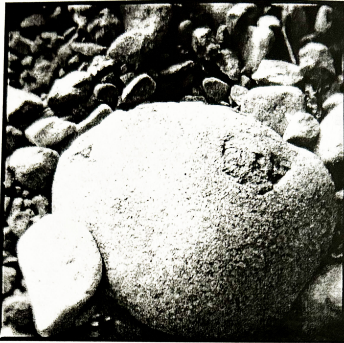
Eagle Rock, Deer Fork Ranch, Montana. 2012