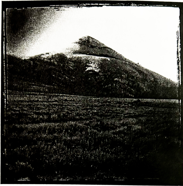
Double Springs, near Upper Pahsimeroi, Idaho. 2012