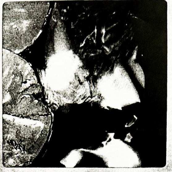
Koi Pond, Columbus, Ohio. 2012