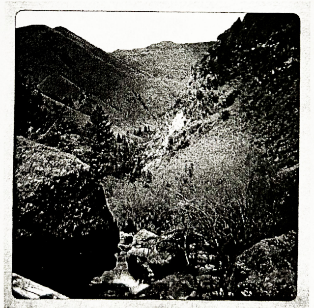
Undisclosed hot springs in Idaho. 2012

where we find earths heated springs fit for kings