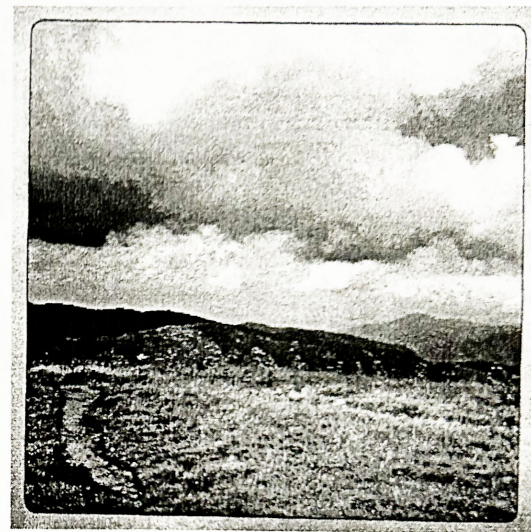
Black Balsam Knob, Blue Ridge Pkwy. North Carolina. 2011