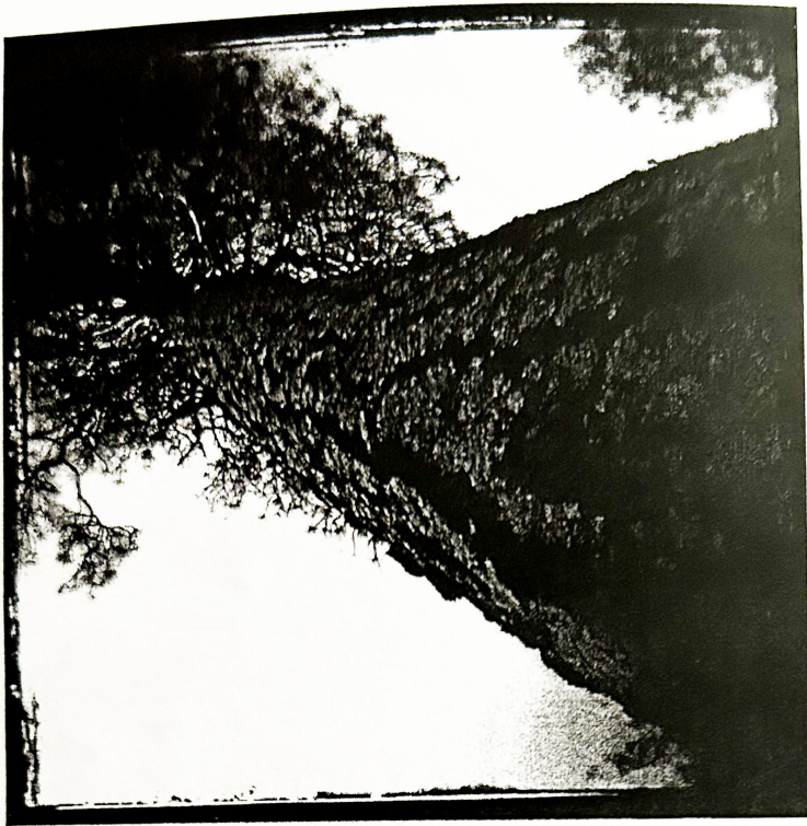
Ponderosa Pine along the Middle Fork of the Salmon River, Idaho. 2012