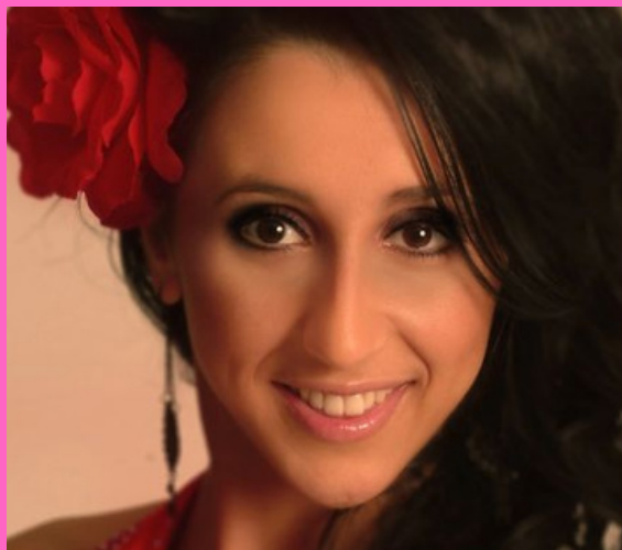
MISS DALENA BALLET, HIP HOP, COMPETITION TEAMS