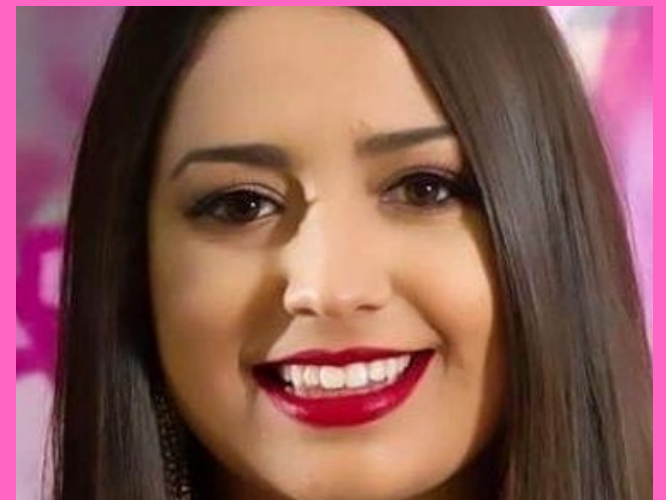
MISS EBONEE ACROBATICS