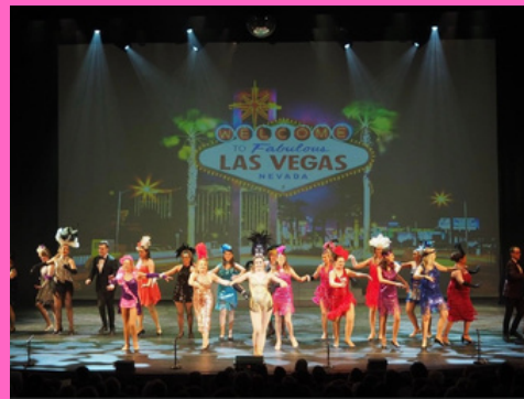
ADULT TAP & JAZZ