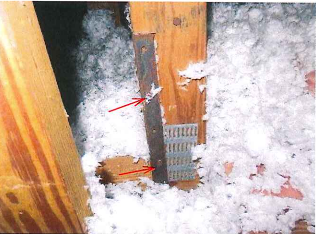
#5 Clips for roof to wall attachment with less than three nails