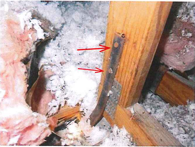
#3 Clips for roof to wall attachment with less than three nails