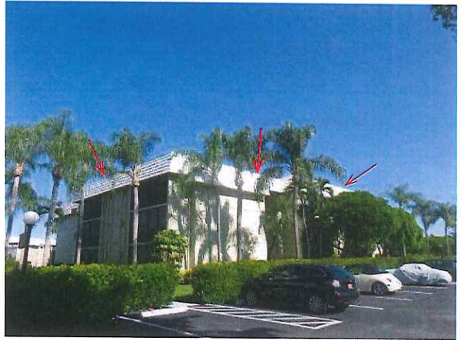
#8 Flat roof