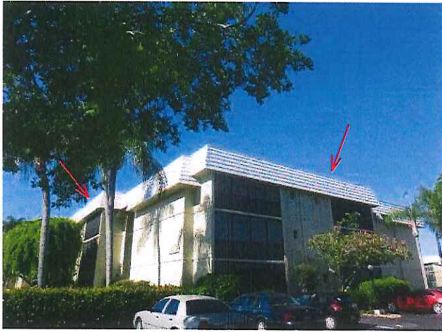
#7 Flat roof

Page 2 of 2 Hidden Lakes788A wind inspection photographs .alb6