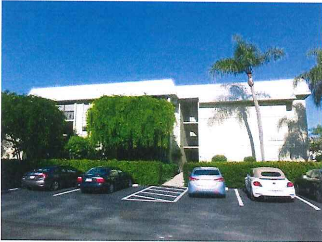
#1 Front view of the building

Page 1 of 2 Hidden Lakes788A wind inspection photographs .alb6