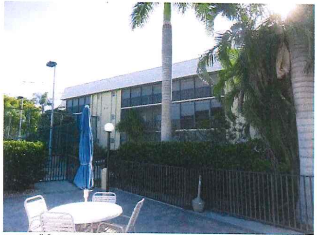
#2 Rear view of the building